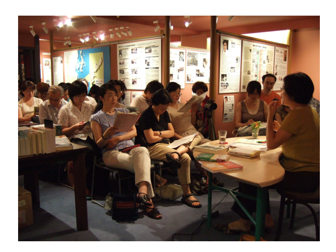
Workshop at the museum