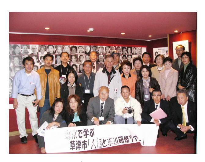
Visitors from Kusazu, Gunma