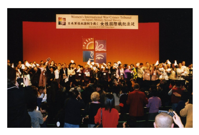
Women's International War Crimes Tribunal on Japan's Military Sexual Slavery

There were three reasons that we opened WAM. The first was to preserve records of the Women's International Tribunal on Japan's Military Sexual Slavery (hereafter, the Women's Tribunal), which was held in Tokyo in December 2000 with judges from five continents who specialize in international law.