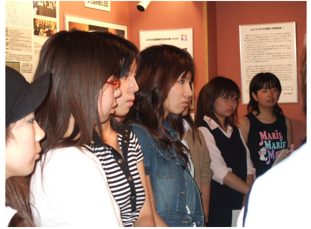
Student Visitors to WAM

Growing numbers of high school students, college students, and people in their twenties are coming to the museum. Some schools make field trips to our museum a part of their curriculum. Although we still receive harassing e-mails, I believe the museum is gradually expanding its role in public education.