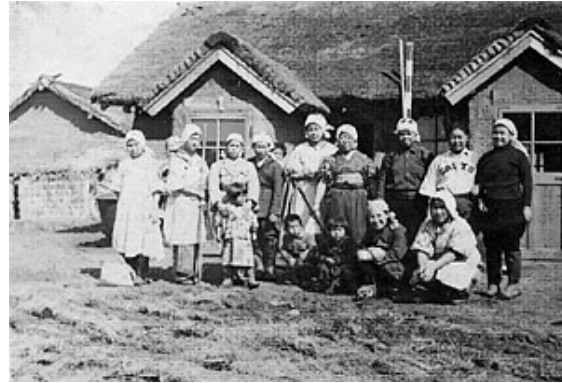
Japanese settlers from Saitama Prefecture

We young Japanese at the time were burning with passion to establish an ideal state on Manchurian terrain in which there would be ethnic harmony, and thus we hurried off to Manzhouguo. We poured our hearts and souls into building such a state... As history moved forward, the ideal of ethnic harmony would have gradually increased in radiance. Without this, I believe that perpetual peace in the world is impossible to attain. In this sense, then, the ideals of building that state of Manzhouguo will live on forever. [10]