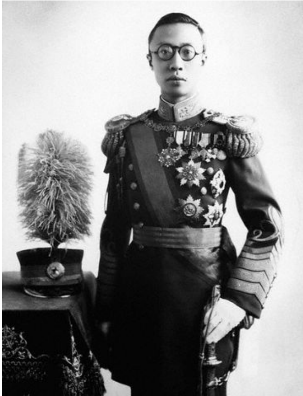
Puyi as the Kangde Emperor of Manzhouguo

In Chinese history texts and dictionaries, by contrast, Manzhouguo is described in the following manner: a puppet regime fabricated by Japanese imperialism after the armed invasion of the Three Eastern Provinces (also known as Manchuria or Northeast China); with the Japan-Manzhouguo Protocol, Japanese imperialism manipulated all political, economic, military, and cultural powers in China's northeast; in 1945 it was crushed with the Chinese people's victory in the anti-Japanese resistance. In order to highlight its puppet nature and its anti-popular qualities, the Chinese refer to it as "wei Manzhouguo" (illegitimate or puppet Manzhouguo) or "wei Man" for short. They frequently refer to its institutions, bureaucratic posts, and laws as the "illegitimate council of state,"