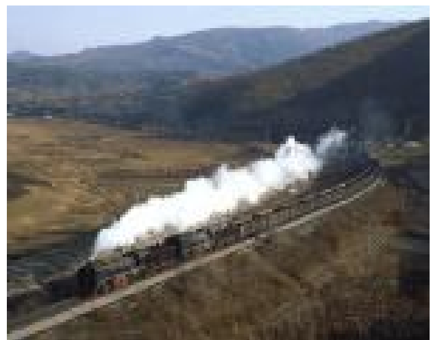
Hunjiang-Tonghua Railway, Manzhouguo

not only at the aspect of the Japanese invasion of the mainland leading to the creation of Manzhouguo but also at the aspect of its accomplishments? In other words, it has been emphasized that despite its short history a “legacy of Manzhouguo” has contributed greatly to the modernization of China’s Northeast in such areas as the development and promotion of industry, the spread of education, the advancement of communications, and administrative maintenance. These attainments, the argument continues, cannot only withstand scrutiny from our perspective today—when ethnic harmony has become an important ideal in politics—but they also warrant significance as an “experiment for the future”—namely, what may be possible in the arena of cooperation among different ethnic groups in years to come. Can this argument be justified?