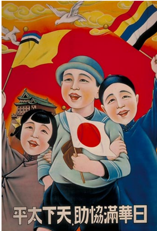
Propaganda poster hails Japan, China, Manchu cooperation

Guandong Army Staff Officer Katakura Tadashi (1898-1991), who promoted the establishment of Manzhouguo, saw it as the manifestation of a humanism based on the lofty ideals of peace, prosperity, and ethnic harmony. “In the final analysis,” he averred, “as a cornerstone for stability in East Asia, it was an abundant efflorescence.” [4 Similarly, Hoshino Naoki (1892-1978), who worked as director of the Management and Coordination Agency, endlessly praised the formation of Manzhouguo: “Not only did the Japanese take a leading position, but all the ethnic groups of East Asia broadly worked together for development and growth. We were building a new