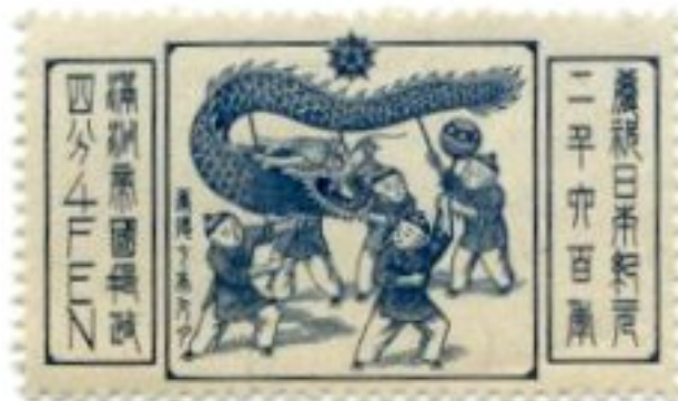
Anniversary stamps of Manzhouguo

Kishi Nobusuke (1896-1987), who worked as deputy director of the Management and Coordination Agency of Manzhouguo