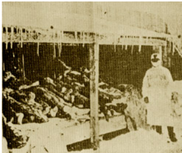
Body disposal at Unit 731

Each person is likely to see the level and character of “puppetry” in Manzhouguo somewhat differently. While the concept of an illegitimate or puppet state may be too strong for many Japanese to accept, once exposed to the Chinese museum exhibits and pictures depicting excruciating pain in such places as the Museum of the Illegitimate Manzhouguo Monarchy in Changchun, or the Northeast China Martyrs Museum and the Museum of the Evidence of the Crimes of Unit 731 of the Japanese Army of Aggression in Harbin, or the Hall of the Remains of the Martyred Comrades at Pingdingshan in Fushun, comfortable images will no longer be acceptable.