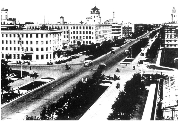
Hsinking avenue in Hsinking, the capital of Manzhouguo, subsequently renamed Changchun.

In fact, the Japanese are by no means the only ones still affected. Indeed, the Chinese and Koreans who lived in Manzhouguo suffered far more and bore far heavier burdens. Certainly for descendants of those “suppressed” as “bandits” who opposed the state of Manzhouguo and Japan and for those who had their lands confiscated by such organizations as East Asian Industry (To-A kangyo) and the Manchurian Colonization Corporation (Manshu takushoku kosha), the shadow of Manzhouguo always lingers close at hand and never leaves for long. So, too, for those who may have participated in Manzhouguo affairs or been pro-Japanese and were subjected to persecution by their fellow nationals, particularly at such times as the Cultural Revolution in China. Furthermore, among those Koreans who, in conjunction with the colonial policy of Japan and Manzhouguo, were forcibly moved there, many were mobilized by the Guandong (also transcribed as Kwantung) Army and taken prisoner in Siberia, and later—after the disintegration of Manzhouguo—wanted to