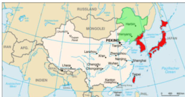
Manzhouguo shown in green