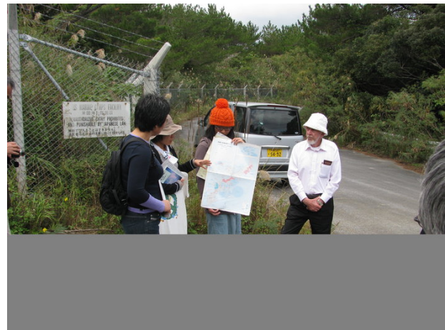
Author being briefed at the site of the Helipad Sit-In, Higashi village, Yambaru, Okinawa, 6 December 2009.

dual-runway and military port project of 2006, and having experienced the emptiness of the promise of economic growth in return for base submission, Okinawans were in no mood to be tricked again.