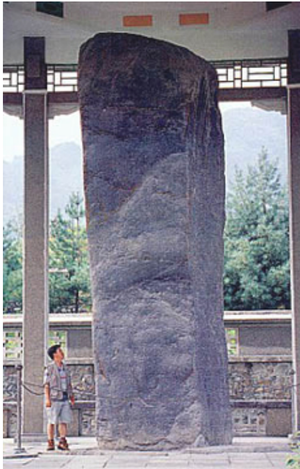
Figure 7: The King Kwanggaet'o stele in Ji'an, China