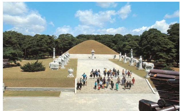
Figure 3: King Tongmyong's Mausoleum, North Korea

Not only Koguryo history but also its relics constitute a source of tension between China and Korea. The conflict already surfaced in differences in interpreting the ancient history amongst North Koreans and Chinese in the joint archaeological excavation of the early 1960s. The political implication of archaeologists' work was demonstrated when the joint archaeological project was halted. Koguryo tomb murals are found on both sides of the Chinese-North Korean border as well as in South Korea (Yeo 2005). So far, in total over 10,000 tombs belonging to the Koguryo