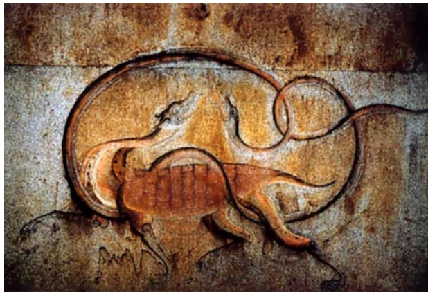
Figure 6: A snake crossed with a tortoise. Kansa Middle-sized Mound, 7th Century in the Kitora Tomb in Asukamura, Nara prefecture, Japan.

they were influenced by Japan's funerary culture. As examples of Koguryo's influence on Japan's funerary culture, the Takamatsu Tomb and the Kitora Tomb in Japan have been cited. [31] She concludes that the influence of Koguryo seen in Japan and the Korean peninsula demonstrates its prominent position as a culturally powerful regional state (Kang 2004: 106-107). As such, the Koguryo archaeological remains represent the legacy and hegemony of regional culture.