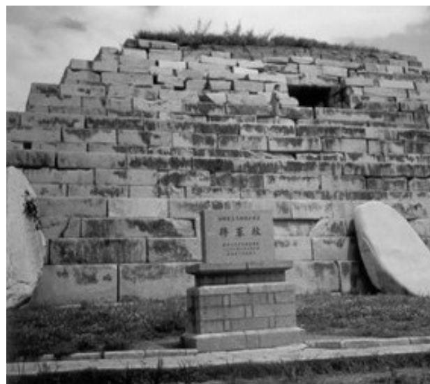
Figure 10: Tomb of King Changsu