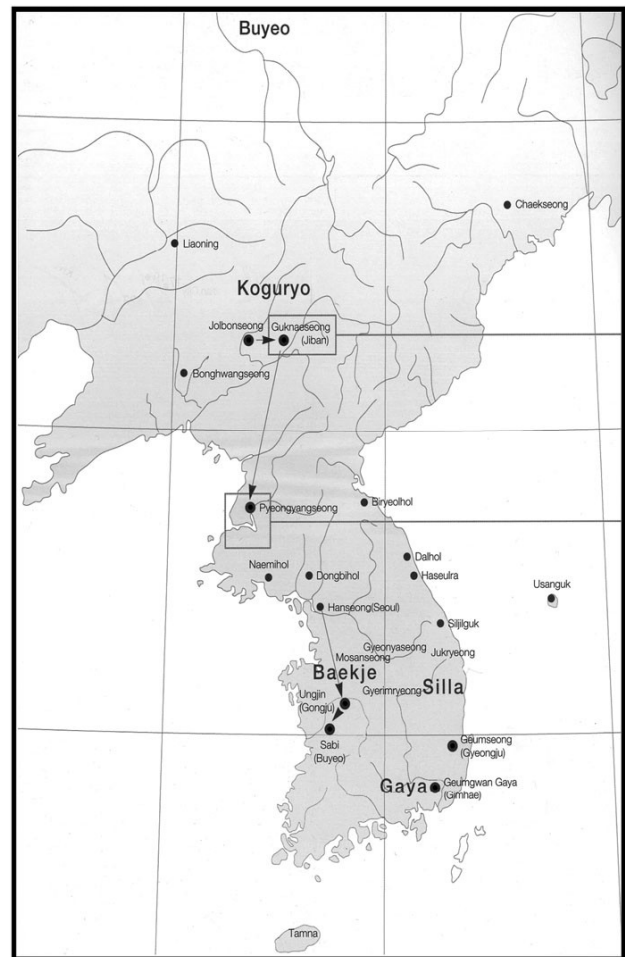
Figure 1 : Map of Koguryo/Gaogouli

debate between China and Korea. It concerns the history and heritage of Koguryo/Gaogouli (37BC-AD668) [1], which is often referred to as one of the ancient Three Kingdoms of Korea, along with Paekche and Silla. Koguryo/Gaogouli encompassed a vast area from central Manchuria to south of Seoul at the height of its power, around the fifth century (Im Ki-hwan 2004: 98).