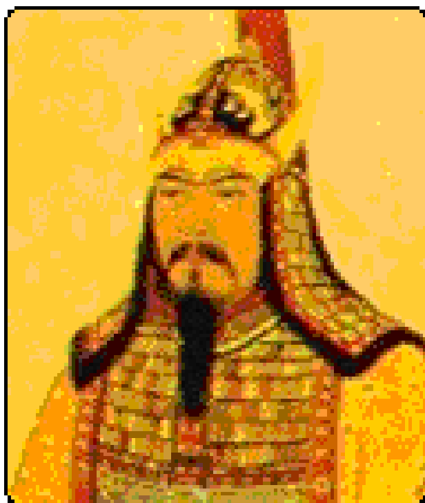
Figure 9: King Kwanggaet'o the Great

Last but not least, questions of gender are ignored in mainstream national historiography on Koguryo. National heroes are constructed as masculine: for example, the ancient historical figures like King Kwanggaet'o the Great and his son King Changsu are presented as a source of Korean national pride. Their conquests in the Northeast provinces are attributed to the victory of Korea's virile "national masculinity". Accordingly, in praising masculine achievement in history, women become invisible and images of male domination are reinforced.