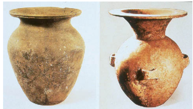
Figure 5: Jars excavated on Mount Mandal, Pyongyang, North Korea.

Koguryo's relics are highly regarded in the rivalry between China and Korea. This indicates that heritage constitutes an influential part of cultural hegemony in East Asia and also, a powerful part of the cultural and historical patrimony of the people, both in Korea and especially in the Northeast Provinces in China. Kang Hyun-sook (2004), professor of Ancient Art in South Korea, maintains the distinctiveness and influence of Koguryo culture in East Asia in underlining that the Koguryo tombs with murals were not mere imitation of their Chinese counterparts and that