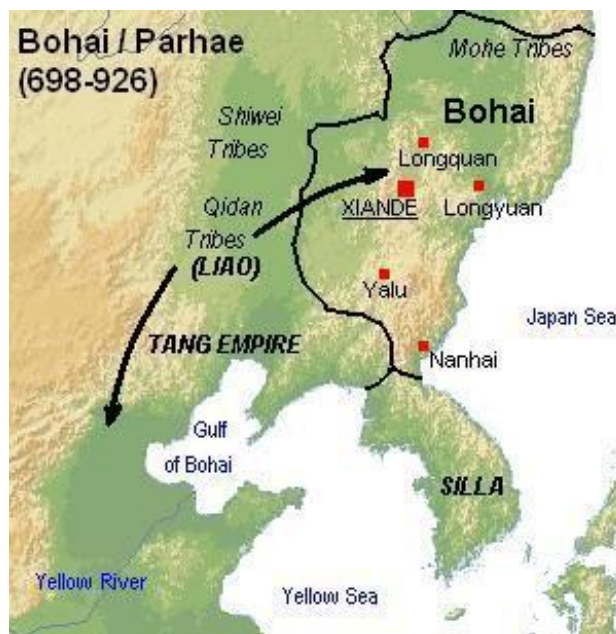
Figure 2: Map of Bohai/Parhae

“During the Sui and Tang, the Mohe lived along the Songhua and Heilong Rivers. In the second half of the seventh Century the Sumo-Mohe tribe grew stronger. At the end of the seventh century Da Zuerong, the leader of the Sumo, united all tribes and formed a government. Later the Tang Emperor Xuanzong proclaimed Da Zuerong King of the Bohai Commandery. After this proclamation, the Sumo-Mohe government called itself Bohai.” [3]