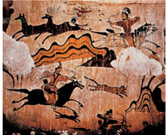
Figure 4 : A hunting scene in the Tomb Muyongchong, in Ji'an, located in contemporary Jilin Province, China.