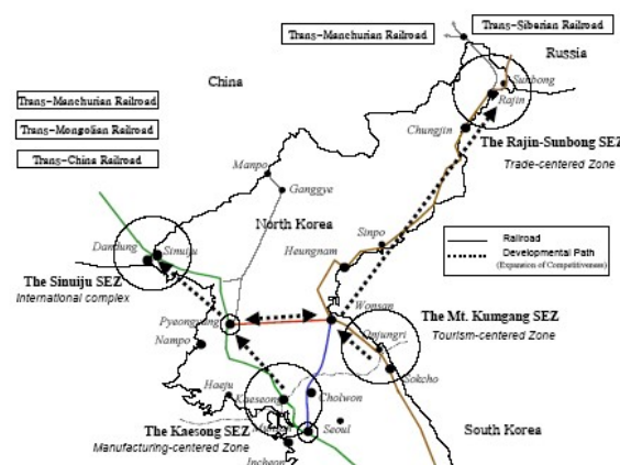
Figure 1. The Developmental Path of the North Korean SEZs

As a consequence, the proportion of the economically active population (15-64 year olds), which was 61.4 per cent in 2003, will rise to 62.7 per cent in 2010 and 64.0 per cent in 2020 before falling to as low as 53.7 per cent by 2050 (Donga ilbo 2005). This portends a declining labor supply. According to a report by the Korea Labor Institute (2005), Korea will face a severe labor shortage beginning in 2010. Assuming that Korea's economic growth averages 4.5 per cent and that there will be an annual 1.51 per cent increase in demand for labor during the next 15 years, there will be a shortage of 586,000 workers in 2015 and 1.23 million in 2020. A Bank of Korea estimate is even higher, projecting a shortage of up to 4.8 million workers in 2020 (Bank of Korea 2006).