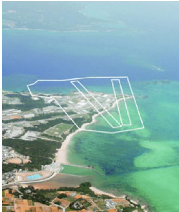
The Henoko base construction plan for twin runways

Prime Minister Koizumi recognized defeat, dropped the design to which Japan's government had been committed for a decade, and in the US-Japan Agreements on Reorganization of US Forces in Japan (2005-6) adopted a new plan. This time, instead of a construction offshore from Henoko, the base would be built on Cape Henoko itself and would be developed out of an existing US base, where he must have assumed that construction works could more easily be screened from public protest. But no change could conceal the fact that the heliport of 1996 had evolved into a monster comprehensive sea and air-base, with twin, V-shaped, 1,600 metre runways, to be constructed on the almost pristine marine environment, where a precious colony of blue coral was only discovered during 2007, where the protected dugong graze on sea-grasses, turtles come to rest, and multiple rare birds, insects and animals thrive.