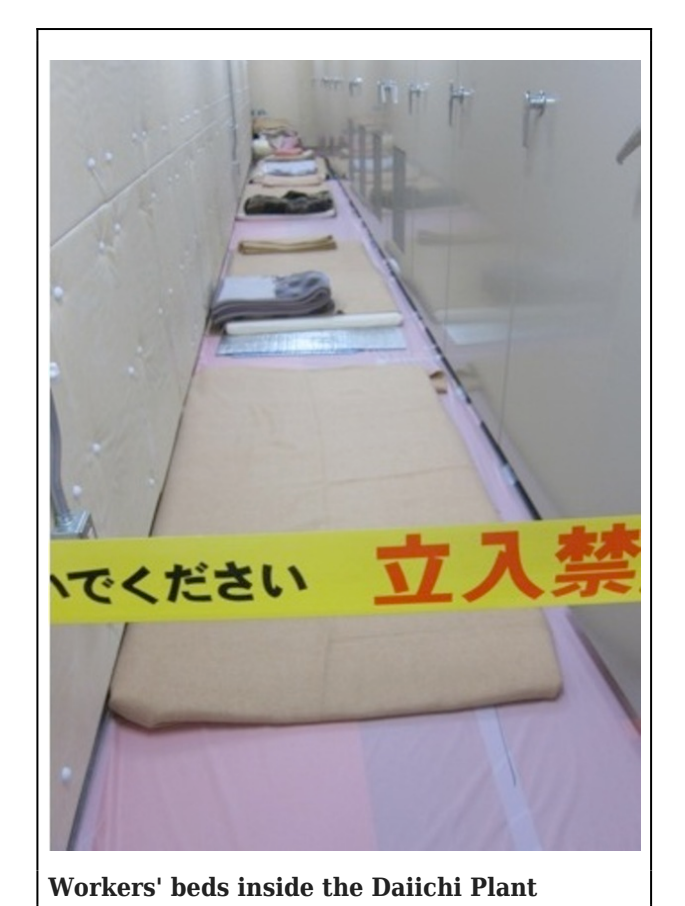
Cleaning up and compensating for the triple disaster will add to Japan's already groaning debt burden. Although its powerful economy is

Outside the zone, the government is decontaminating hundreds of thousands of acres of farmland and forest by scraping off a 5 cm-layer of topsoil, an operation it estimates will leave a pile of nuclear waste almost 29 million cubic meters high – enough to fill one of Tokyo's largest stadiums 80 times. Across the Fukushima countryside, trucks trundle to 'temporary' dumps with their cargo of poisoned clay past mask-wearing security guards, a plan Ito and others insist is doomed to failure. "They're just moving the radiation from one place to another," he says. "Who is going to take it when they're finished? Fukushima will stay poisoned for decades to come."