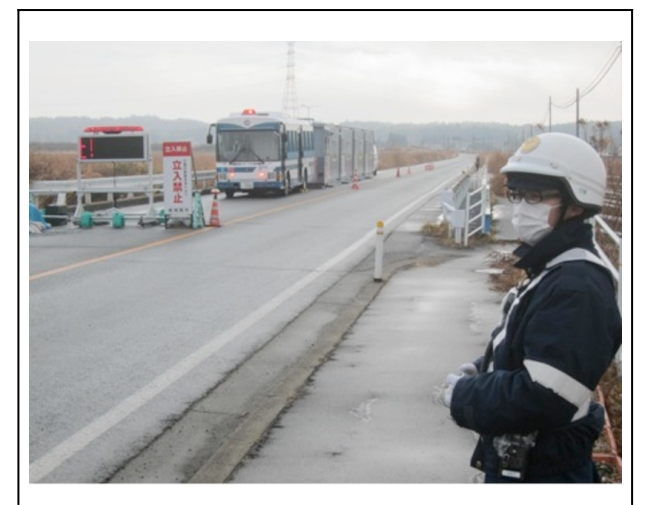
Checkpoint on the outskirts of Minamisoma into the 20km exclusion zone

Today, the power plant is officially "in a state of cold shutdown" according to Tepco. The 20km exclusion zone that surrounds it runs into the southern border of Minamisoma and swallows up Mayor Sakurai's small farm. Police officers with dosimeters pinned to their chests prevent locals from going through a roadblock, even the Mayor who runs the city. Reporters and citizens who venture inside through back roads can be arrested.