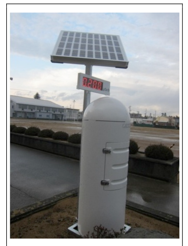
Outside IItate Village Office, Feb. 2012

Cleaning up the contamination and convincing people to return is a mammoth task. Across the region, workers in boiler suits and masks have descended on towns with power hoses, trying to scour the Daiichi plant's toxic payload from playgrounds, parks and other public areas. The workers have removed most of the most dangerous contaminant - cesium - from the grounds of Minamisoma Middle High School, says its principal Hamano Shinichi. Like other public buildings here, the school has planted a large dosimeter outside its front gates showing the current radiation in large digital letters in an attempt to reassure local parents - with limited success. Only half of its 360 students have returned since last year, Principal Hamano admits.