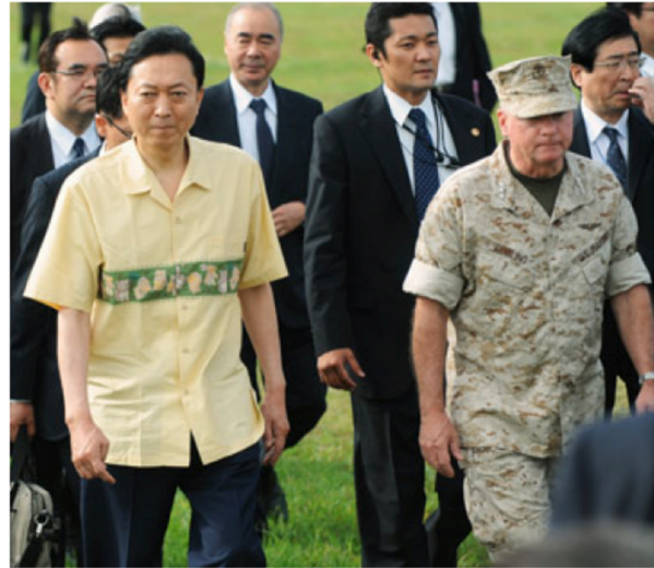
Hatoyama visits Okinawa, May 4, 2010

Mainland media for the most part simply relayed the US message, turning a blind eye to the intimidation and interference in Japan’s affairs. 42 Only the Okinawan newspapers lambasted the Hatoyama government for its inability to counter the US’s “intimidatory diplomacy” (as Ryukyu shimpo put it) and for its drift back towards “acceptance of the status quo of following the US.” “If that is to be the new government,” it concluded, “then the change of government has been a failure.” 43 In the US, officials, pundits, and commentators alike supported the Guam treaty formula and showed neither sympathy nor understanding for Japanese democracy or Okinawan civil society.