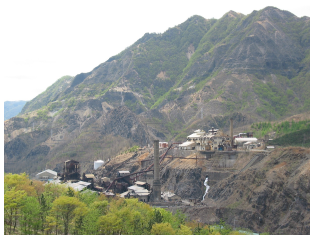
FIG. 3: Remains of the Ashio Refinery, 2002.

At Ashio itself, every year hundreds of volunteers from Ashio Green Growing Association ( Ashio ni Midori o Sodateiru Kai ) assemble near the remains of the Ashio refinery in an attempt to replant the mountainsides. This process is slow and requires much experimentation as the soil still contains large amounts of sulfur left by one hundred years of toxic smoke from Ashio’s stacks.