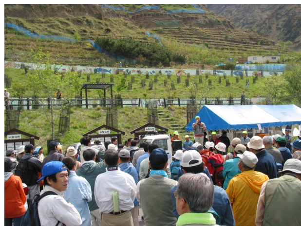
FIG. 4: Meeting of the Ashio Green Growing Association, 2002.