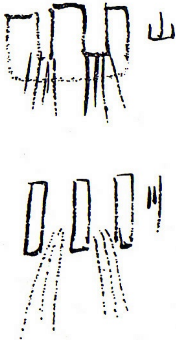
FIG. 2: A Tanaka diary entry from 26 Jan 1912. (Source: Tanaka Shozo zenshu , Iwanami shoten, 1977-80. Vol. 13, p. 65.)

To prevent doku and to foster life, humans needed to learn how to organize themselves in a way that lets them take advantage of the benefits of a freely flowing ecosystem. A diary entry from 26 January 1912 shows Tanaka playing with the Japanese characters for mountain ( yama ) and river ( kawa ) to illustrate the complementary relationship of the land and water in fostering flow. Tanaka's own caption read: "These diagrams express the principle of nature. River managers who understand the meaning of these pictures are rare indeed."