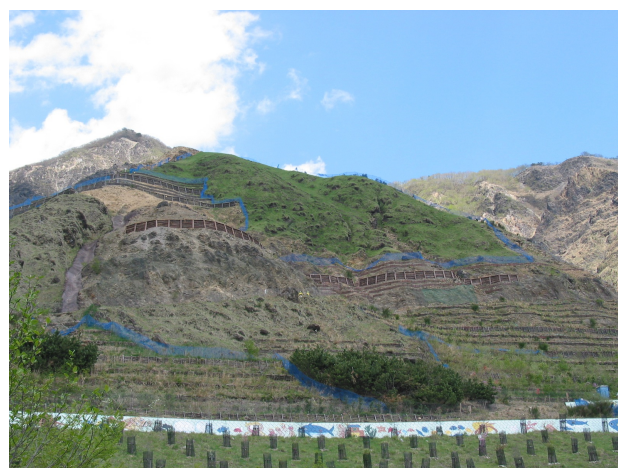
FIG. 5: Experimental reforestation at Ashio: The green zone at the top is a mix of soil, seed and fertilizer sprayed onto the rock in an attempt to compensate for the lack of topsoil.

In a great historical irony, the Yanaka reservoir has become a place of “nature recreation” and its brochure features a cartoon windsurfer enjoying the open water. Yet even while the banks of the reservoir today appear natural, their earthen facades are built on a base of hard-engineering and concrete.