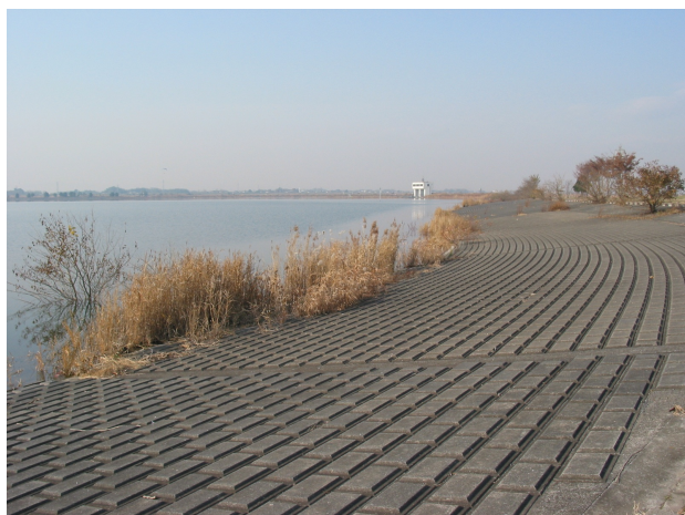
FIG. 6: Concrete bank of the Yanaka Reservoir, 2002.