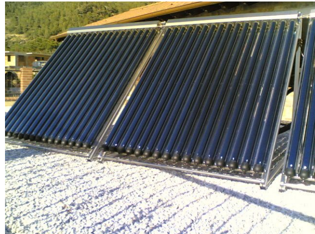
Solar thermal collector, China

First, China continues to lead the world in production and use of solar thermal for water heating, with more than 65 percent of global capacity by the end of 2007. Today, more than one-tenth of China's households rely on the sun to heat their water. China has more than 40 million solar thermal systems in place.