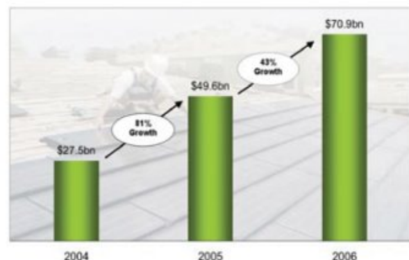
Figure 2. Global Investment in Sustainable Energy, 2004 – 2006

Note: Grossed-up values based on disclosed deals. The figures represent new investment only, and do not include PE buy-outs, acquisitions of renewable energy projects, nor investor exits made through Public Market / OTC offerings.