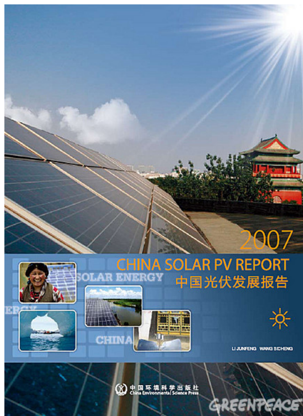
Solar pv, China