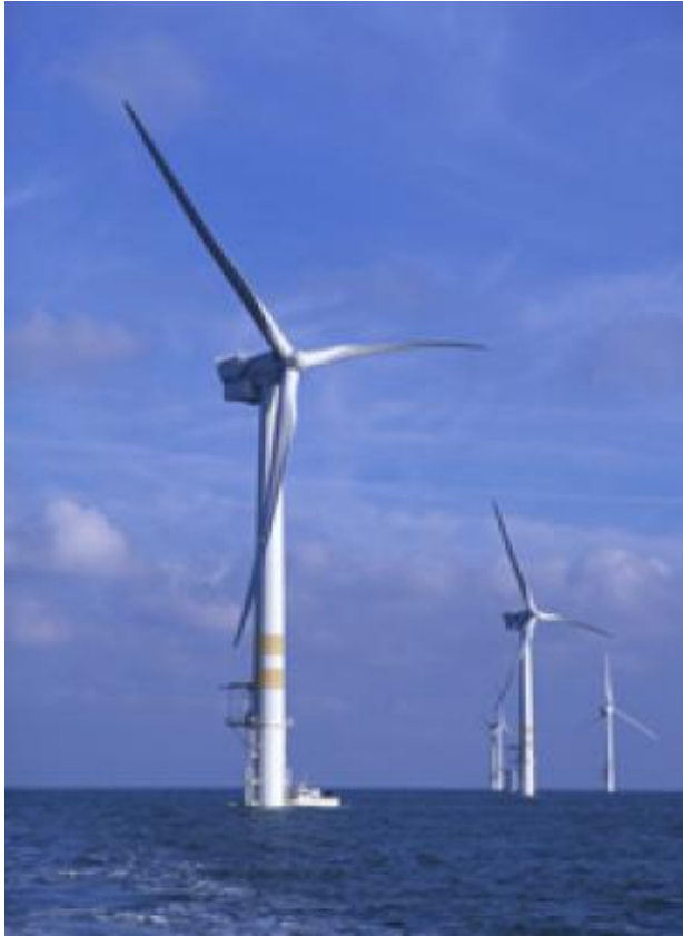
German wind power

We also learn that China, which has been making headlines as a menacing polluter in step with its surging oil and coal consumption, is rapidly emerging as a leader in renewables, and may be the world's top-runner in a few years. China has 65 percent of global capacity in solar thermal for heating water (40 million systems in place), annual doubling of wind-power capacity, and a skyrocketing production and use of solar power. If China's global search for oil and natural gas has driven up the prices of these fuels, Chinese research and production seem likely to drive down prices for solar and other renewables, thus making their diffusion even more rapid and widespread than at present.