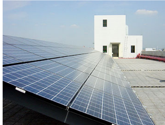
Chinese solar power

We also learn that China, which has been making headlines as a menacing polluter in step with its surging oil and coal consumption, is rapidly emerging as a leader in renewables, and may be the world's top-runner in a few years. China has 65 percent of global capacity in solar thermal for heating water (40 million systems in place), annual doubling of wind-power capacity, and a skyrocketing production and use of solar power. If China's global search for oil and natural gas has driven up the prices of these fuels, Chinese research and production seem likely to drive down prices for solar and other renewables, thus making their diffusion even more rapid and widespread than at present.