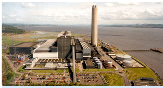
Biomass power, Scotland

Global capacity of small hydropower and biomass power came to 73 GW and 45 GW respectively by the end of 2006. Solar thermal for power generation is another promising technology that is again seeing growth, with new projects in the United States and Spain. And solar thermal for water heating continues its rapid rise. Rooftop solar collectors now provide hot water for more than 50 million households worldwide.