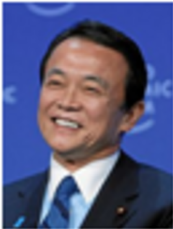
Asō Tarō, Japan's Catholic prime minister (2008-9)

hinges, of course, on state patronage of the shrine, which is contentious on at least two counts: it is a 'legal' problem since the Constitution provides for the separation of religion and state; and a 'symbolic' one since Yasukuni enshrines Japan's A-class war criminals. Against this institutional position, I set the views of some prominent Catholic intellectuals. What is striking is that, on the whole, these Catholics distance themselves from the critical stance of the Japanese bishops, and share with the Vatican, and indeed with former PM Asō, a broadly positive 'take' on Yasukuni. My method here is to introduce faithfully a selection of their views, and let the reader judge their merits. In the final section, the present author, who is also a Catholic, offers his own argument on Yasukuni and the challenges it poses in the 21st century.