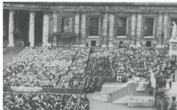
The papal Mass in St. Peter's, 22.5.80

There is a context to the concern expressed by the two post-war pontiffs for the Japanese war criminals. The context is provided by a document styled Pluries Instanterque , issued by the Society for the Propagation of the Faith ( Propaganda Fide ) in 1951. Or rather, it was re-issued in 1951, for its origins go back to 1936. Pluries Instanterque was the Catholic Church's response to the prewar dilemma in which Catholics found themselves, when required by their university, say, to visit Yasukuni and other shrines, and makes acts of obeisance. The Catholic Church's position had been that Catholics' participation in shrine rites of any sort was unacceptable, and this in turn had led to the infamous Sophia University incident of