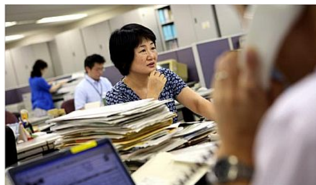
Japanese women office workers

Even more critical, according to the February 2006 data compiled by the Inter-Parliamentary Union (IPU), Japan stood in 105 th place on women's shares of seats in a lower or single house (9 percent). Today, many developing countries such as Rwanda (48.8 percent), Pakistan (21.3 percent) and the Philippines (15.7 percent) far exceed Japan in terms of women's share of seats in a lower or single house. [5]