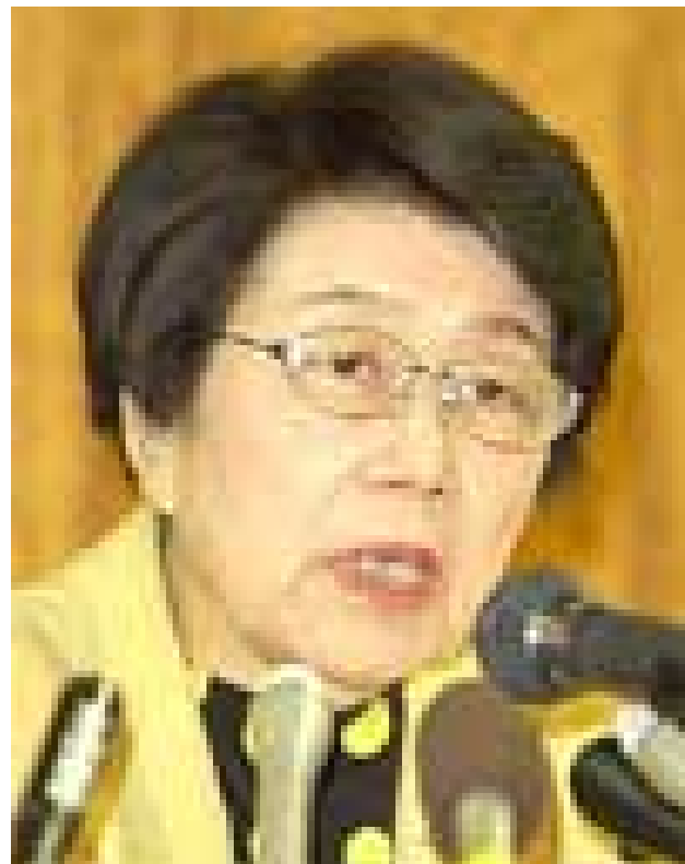
Doi Takako, Japan's leading woman politician as leader of the Socialist Party (1996-2003) and President of the Diet (1993-97)

Representatives. In the following year, Japan introduced a new system for the lower house, made up of medium-sized multi-member districts (3 to 5 seats in each district) with single non-transferable votes; under this system, women’s seats declined immediately to 15 in the 1947 election and, by the 1986 election, had dropped further to a low of 7 seats. By 1993, the 38-year rule of the LDP ended, and Japan reformed its electoral system to small-sized single-member districts combined with a proportional representation system. In the subsequent 1996 election, women’s seats increased to 23, with 16 of these seats proportionally elected. Proportional representation seemed the most favorable environment for female candidates. [13]