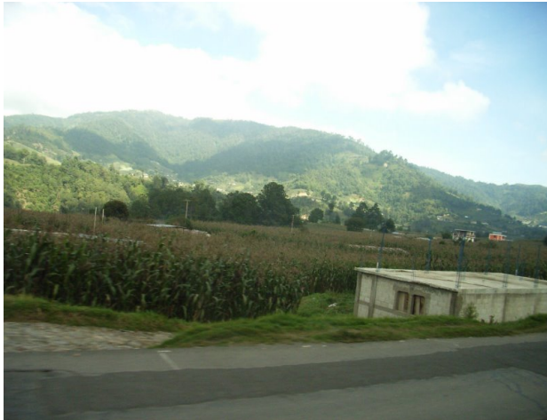
Laotian corn field

A representative from a trading house based in Anhui province traveled 1,500 kilometers this winter to visit a brokerage storage plant in Jilin province, China's foremost corn production area.