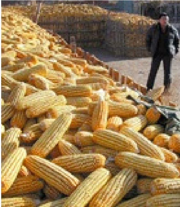
Corn left to dry in Chenjia village, in Jilin province

Just as happened in the early 1970s, when the Soviet Union suddenly accelerated its imports after a sharp fall in domestic grain production, growing demand in China could have global implications, they warn.