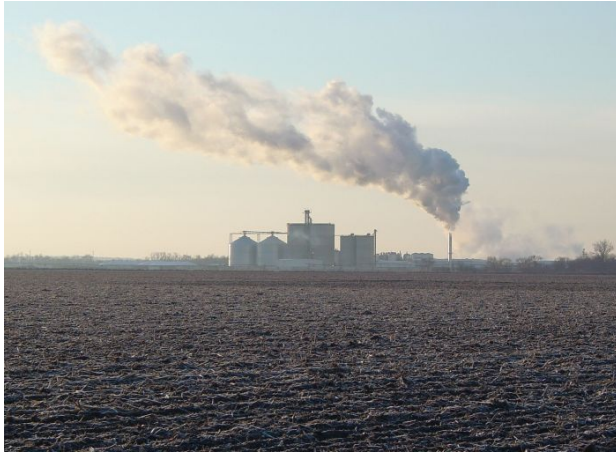
US corn-to-bioethanol plant

China is the world's No. 2 producer of corn, growing about 20 percent of the total. If it becomes an importer, there is no guarantee that it will be able to find suppliers to meet its needs.