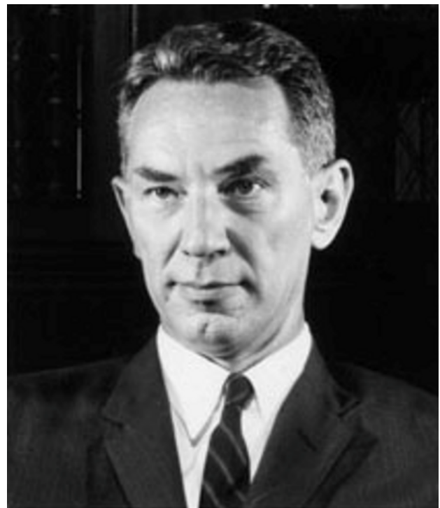
Edwin O. Reischauer

took effect on May 15, 1972. Reischauer’s views expressed in the 1965 memo are at odds with his public description of meetings on reversion he held with Japanese government officials. “On more than one occasion I had told Japanese officials [that] I believed the United States would comply on terms acceptable to Japan, which meant all nuclear weapons removed, as in the American military installations in Japan.” 2