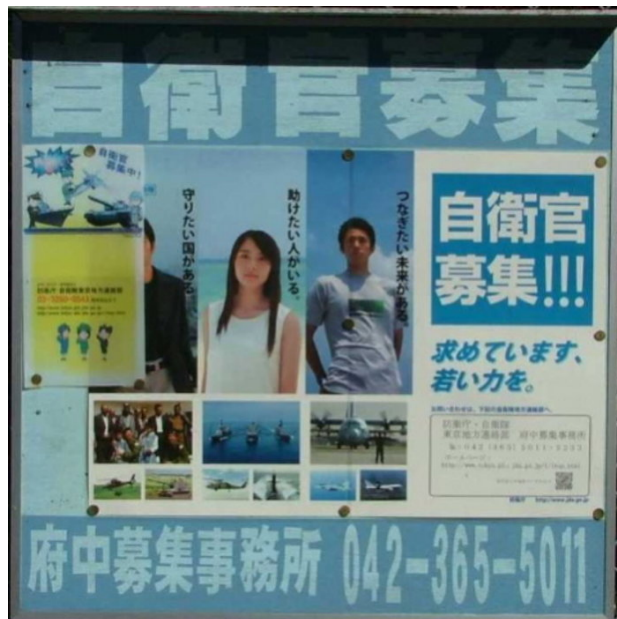
Figure 1: “Self-Defense Force service members recruitment: We appreciate it - young strength. There is a future to which I want to connect. There are people I want to help. There is a land I want to protect” (Self-Defense Forces recruitment poster, 2005. Photographed by Jennifer Robertson).

recruitment materials, the Self-Defense Forces rely primarily on vague slogans, a decisively non-violent symbolism, an unambiguously gendered imagery, a glaring absence of references to the nation, patriotism or other concepts that the Japanese state once had exploited for the purposes of war and imperialism, and the frequent use and appropriations of English phrases. In Japan, public relations posters – more than 100,000 copies of each are printed and distributed all over Japan – address an anonymous wider society that happens to live or walk by billboards on which they are posted next to information about garbage collection, fire exercises, festivals, obituaries, and other announcements that are of interest to the local community.