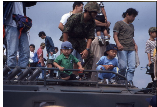
Figure 4: Some visitors are eager to familiarize themselves and their children with the tanks and other military equipment that had been used during the live firing demonstration. Being photographed in the vicinity or on top of the tanks adds excitement and creates an opportunity to review the images at home.

Unlike the playful characterization of a military conflict in cartoons, however, the demonstration has no uncertain outcome. There is very little space for improvisation or individual creativity. Rather, the event is tightly scripted and thus the emphasis shifts to its more dramatic aspects. Hence, the live firing demonstration also involves the spectacularization of violence through the combination of fire, colors, noise, smell and movement. It is this spectacularization that turns actions related to soldiering into entertaining displays.