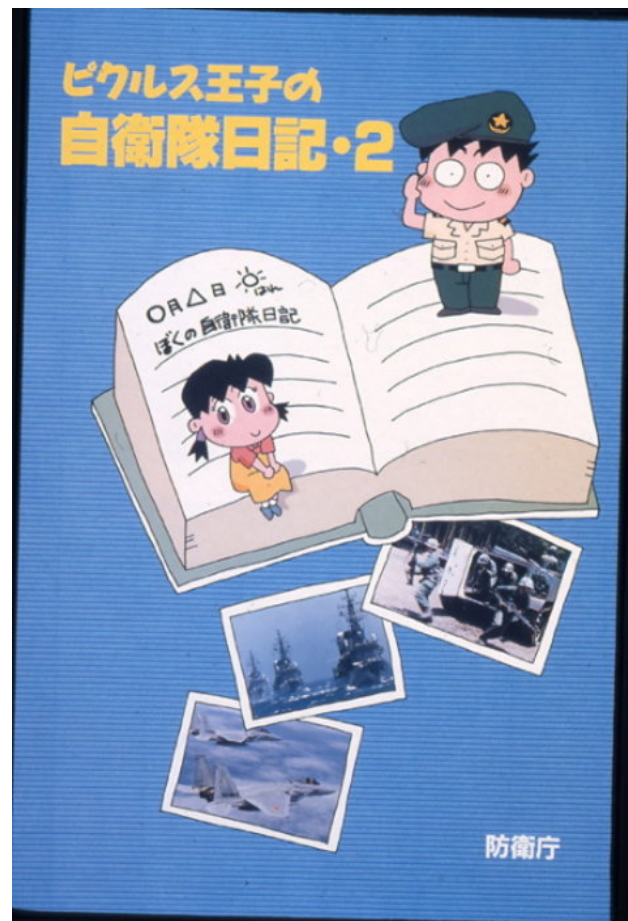
Figure 3: Throughout the two cartoon volumes, Prince Pickles: The Journey to Peace and Prince Pickles Self-Defense Forces Diary II , Prince Pickles frequently changes his outfit from the various uniforms of the Self-Defense Forces to fantasy costumes that emphasize his superhuman spirit and commitment to world peace.

fat, mean-looking emperor stuffs himself with food and wine. His character as a despot who suppresses his people is indicated by his subservient and anxious butler. Eventually Gōma’s butler tells his master that there will not be any food left for the winter if he continues to eat so much now. Gōma gets angry and announces that if they do not have food of their own they will have to steal it from somewhere else.