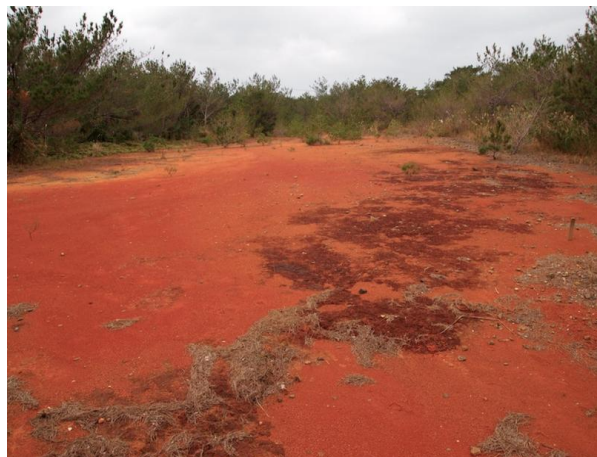
Defoliated area in Higashi Village Jon

Higashi Village. According to a former U.S. military official interviewed by the Okinawa Times last year, defoliants were tested in the jungle near Higashi Village between 1960 and 1962. In 1963, the Pentagon apparently returned a patch of that land to civilian control, but even today it lies barren.