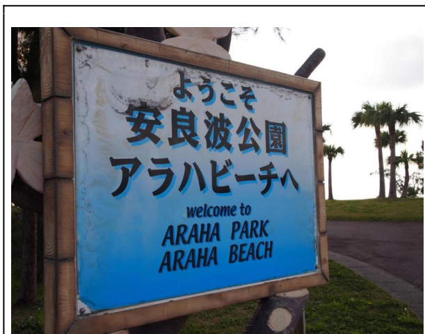
A sign welcomes visitors to Araha Beach - site of the alleged burial of hundreds of barrels of Agent Orange

The U.S. Department of Veterans Affairs has awarded two more former service members compensation for exposure to Agent Orange while serving on Okinawa during the 1960s and '70s. An army truck driver who came into contact with the dioxin-tainted defoliant as he unloaded barrels at Naha Port in 1966 is receiving benefits for lung cancer attributed to his exposure. The second veteran, a former marine stationed on the island in the early 1970s, developed Hodgkin's lymphoma and type 2 diabetes mellitus as a result of his work with contaminated military equipment shipped to Okinawa from the war in Vietnam, the VA ruled.