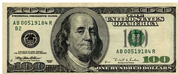
US 100 dollar supernote