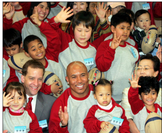
Hines Ward (bottom, center), on his visit to South Korea in April 2006, participates in an event held by the Pearl S. Buck International Foundation in Seoul

advertisements in Korea. Ward received a “hero’s welcome” on his first visit to his “motherland” in April 2006. The tacit, if unintentional, message underlying these stories was that neither pure blood nor culture is a necessary attribute of Koreanness. After all, Ward’s blood is “mixed” and he grew up in the United States where, as a young man, he learned almost nothing about his Korean heritage or Korean culture, including how to speak Korean. Ward’s embrace, it is important to emphasize, was different from that of other Amerasians or “mixed blood” entertainers or sports figures in South Korea (as well as in Japan and other Asian countries): he sparked a significant national debate on Korean identity and the country’s “shameful” history of discrimination. Even more, Ward’s success provoked a number of immediate policy changes. Shortly after his visit to South Korea, for example, the Ministry of Education announced that middle school textbooks would no longer describe Korea as a “nation unified by one bloodline,” but instead speak of “a multiethnic and multicultural society.”