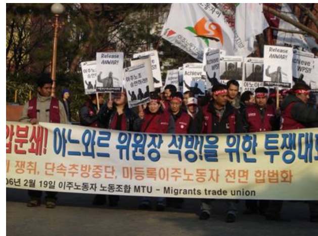
A protest organized by the Migrants Trade Union (MTU), an organization of foreign workers in South Korea, February 18, 2009

of Koreanness that determines who is, and who is not, classified as Korean.