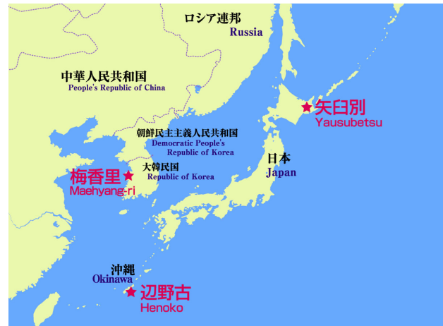
Locations of Yausubetsu, Henoko and Maehyang-ri

Dancing). The section on Maehyang-ri documents the village's successful campaign to prevent an island just offshore being used for target practice by artillery, aircraft and helicopters. The live-fire range was shut down in August 2005. The section on Henoko showed anti-base activists canoeing out to rigs in Henoko Bay to prevent survey work in preparation for the construction of a new base. In Henoko, anti-base activists have teamed up with environmentalists because the proposed base site is an important habitat for the endangered marine mammal the dugong. The fight to prevent the Henoko project is ongoing in 2008. [6]