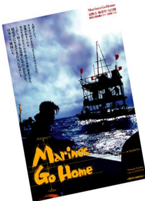
Publicity Poster for Marines Go Home