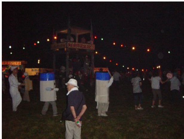
Photo of Heiwa Bon-odori