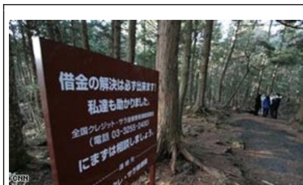
Japan's Aokigahara Forest is known as the "suicide forest" because people often go there to take their own lives

Recently some physiologists raised doubts about curing depression simply by prescribing anti-depressants. There is growing concern among medical professionals that the Administration's plan of simply catching depression in its early stages will work. However, some involved in suicide prevention programs say that doing something is better than doing nothing. Tokyo has so far spent almost all its funds on holding suicide prevention lectures by well-known psychologists and psychiatrists, and sponsoring other events like courses for gate-keepers.