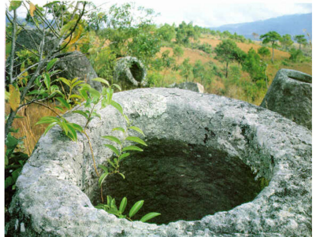
At Lat Sen, sandstone jars are arrayed on the top of a steep hill. Network Aspen