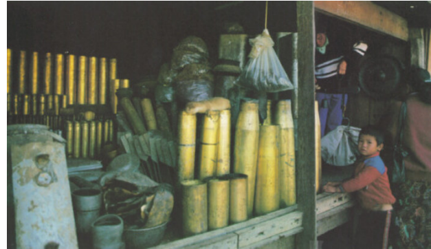
In a shop in Phomsavan, right, recycled shells are offered for sale as containers.

Parmentier identified three types of jars at Ban Ang: squat-shaped ones, slender ones, and others that were "almost sections of squared or rectangular prisms, with well-rounded corners." And he was able to form an idea of what a typical jar contained before it was disturbed: one or two black pots, one or two hand axes, "a bizarre object which we call a lamp," often a spindle weight of iron, glass beads, drilled carnelian beads, earrings of stone or glass, bronze bells, and frequently the debris of human bones.