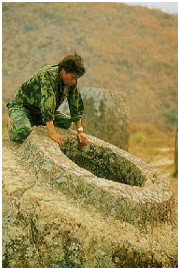
A Lao soldier peers into a mammoth jar at Ban Ang, the principal jar site.