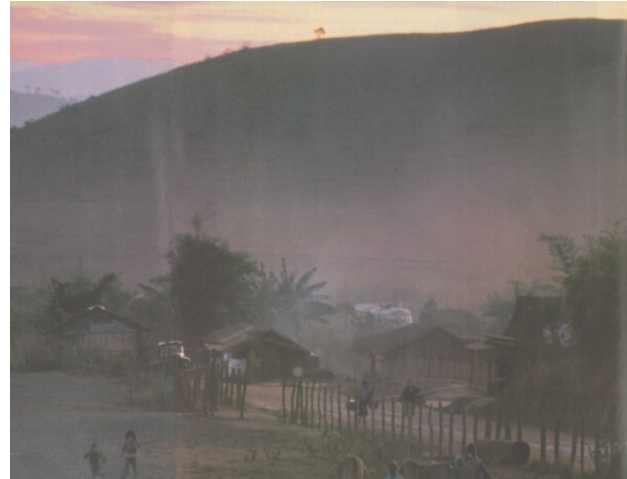
The main road near Phomsavan, on the Plain of Jars. Most Lao are subsistence farmers.