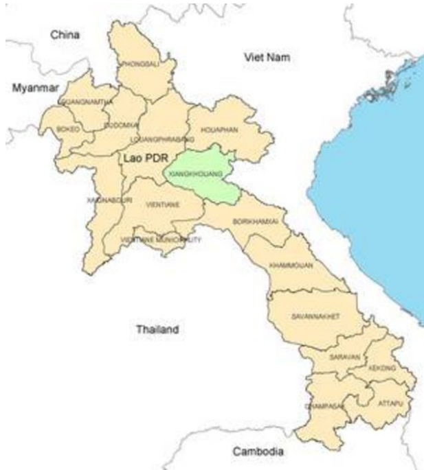
Map of Laos showing Xieng Khouang province

After long years of self-imposed isolation, Laos has opened its doors to tourists - mostly backpackers and the odd anthropologist - attracted by its landscapes, its cultures, and even its megalithic sites, as contributing significantly to income and employment. The Plain of Jars on the Xieng Khouang Plateau is a major cultural heritage site, now recognized by UNESCO. According to UNESCO , unexploded military ordinance (UXO) still contaminates 25 percent of the area of Xieng Khouang province, producing a "constant threat" to the personal safety of its 200,000 people. Needless to say, the presence of UXO crimps economic development of the province. UNESCO is not only concerned with UXO infestation, but with the safeguarding of the priceless megalithic stone jar heritage, as described and illustrated here by Russell Ciochon and Jamie James. Commencing in 1998, with the cooperation of the LPDR, UNESCO launched a multi-year plan to map the Plain of Jars, currently entering the final phase (2006-2010) of UXO clearance, "pro-poor tourism" and "sustainable resources