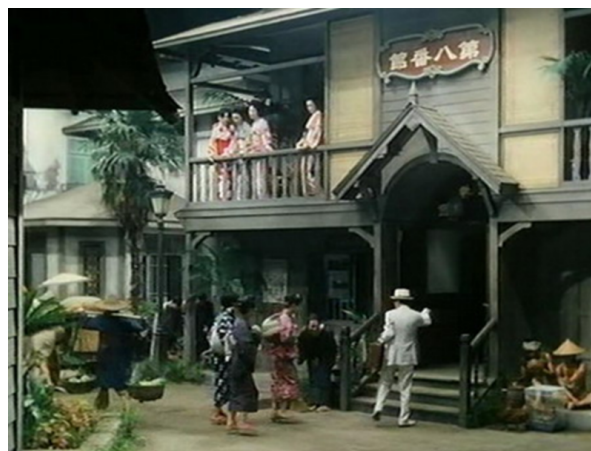
Karayuki in film. Sandakan 8.

The work of such agents, which involved canvassing people in one place and transporting them by sea over great distances to another destination, has been documented in the (sensationalist and unreliable) biography of Muraoka Iheji dealing with his role in shipping Japanese women across Southeast Asia through international networks of “slave-trading.” 32 The feminist inspired writings of Yamazaki also focus on the procurer and justifiably point out the significance of this agency whereby men and women were bound up in relations of power in which women were dominated, highlighting the effects of the subordinate position women were placed in.