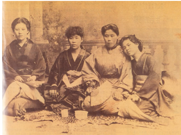
Karayuki in Singapore, Meiji era

Sex in Japan's globalization asks a different set of questions: what was the state's investment in promoting, prohibiting or controlling overseas prostitution by Japanese women? But it also goes on to locate prostitution in relation to Japan's nation-building agenda and to assess the nature and possibility of women's agency under conditions of international prostitution.