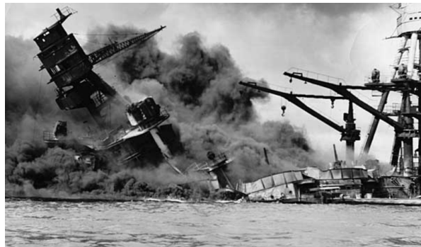
US battleship sinks at Pearl Harbor

The one judicial body to pass judgment on the atomic bomb attacks on Japanese cities was a lower Tokyo court in the Shimoda decision handed down on December 7, 1963, that is, with a subtle touch of Japanese humility, the exact day of the 22 nd anniversary of the Pearl Harbor attacks.