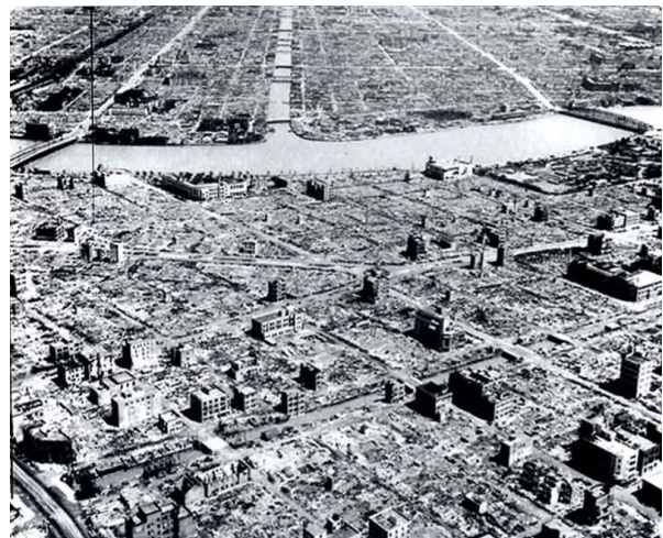
Firebombing of Tokyo MARCH 9-10, 1945

As might have been expected Japan as a defeated state and one that remained subordinate to American military power and diplomatic influence, was not inclined to pursue the matter any further, and seemed precluded from doing so by the peace treaty with the United States. Not surprisingly the Shimoda judgment virtually disappeared down the memory hole of atomic diplomacy. In 1996 the International Court of Justice in an Advisory Opinion responding to a question put to it by the UN General Assembly narrowly defined the conditions under which it might possibly be lawful to resort to nuclear weapons in situations of extreme self-defense that if applied to the 1945 atomic attacks would definitely result in their criminalization. As far as is known no effort has been made by any nuclear weapons state to alter its doctrine governing threat and use, including the threat of nuclear annihilation, in light of this most authoritative assessment of the international law issues at stake by the World Court.