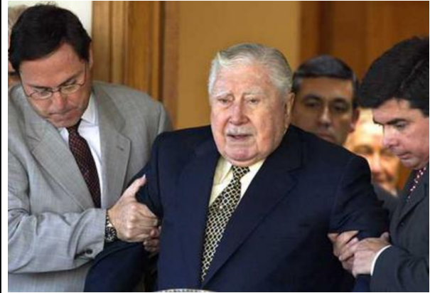
Pinochet brought to trial

This development reached public awareness in relation to the dramatic 1998 detention in Britain of Augusto Pinochet, former ruler of Chile, in response to an extradition request from Spain where criminal charges had been judicially approved. The ambit of UJ is wider than its formal implementation as its mere threat is intimidating, leading those prominent individuals who might be detained and charged to avoid visits to countries where such claims might be plausibly made. In late 2011 George W. Bush cancelled a speaking engagement in Switzerland because of indications that he might be arrested and charged with international crimes if he ventured across the Swiss borders. Similar reports have suggested that high Israeli officials have changed travel plans in response to warnings that they could face arrest, detention or extradition for alleged crimes, especially in recent years those associated with either the Lebanon War of 2006 or the 2008-09 Israeli military attack on Gaza bearing the code name of Operation Cast Lead. In other words, the possibility of an assertion of UJ may have a behavioral and psychological impact even if the defendant is not brought physically before the court to stand trial.