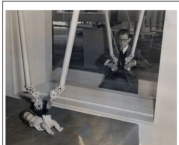
"Magic Hands" Demonstration in Berlin. September 26 1954.

museum, was similarly moved. The women, who had been brought to the United States for plastic surgery at American expense, wrote that, "At first, as we were victims of the bomb, we were anxious about [the exhibit]...but after going through the exhibit we understand that Atomic Power can be used not only for war but also can be useful for the advancement of mankind." 62