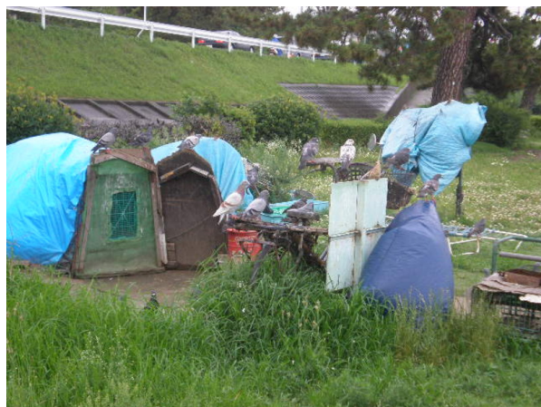
Tents and huts on the bank of the Muko River