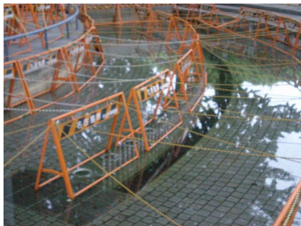
Anti-homeless barriers in Wakamiya Park