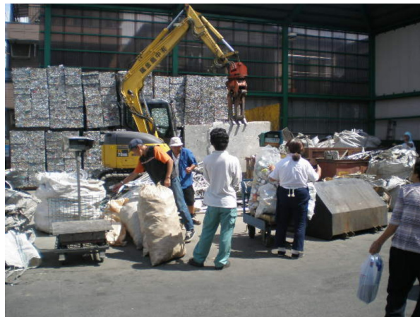
Nakajima Kinzoku, a Kawasaki scrap metal dealer, had the air of a gold-rush town in 2007

it an offense for anyone other than municipal garbage-collectors to remove the contents. What was once viewed as trash is now widely seen as a valuable resource. Kawasaki's mighty neighbor, Yokohama, has passed such an ordinance. 8