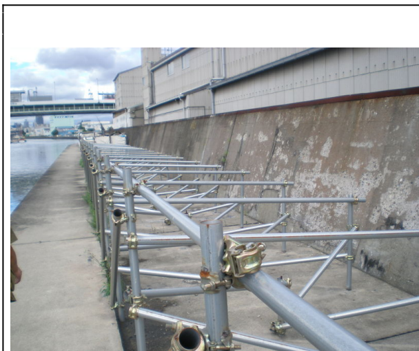
Scaffolding designed to prevent shack construction on the Kizu River, Osaka