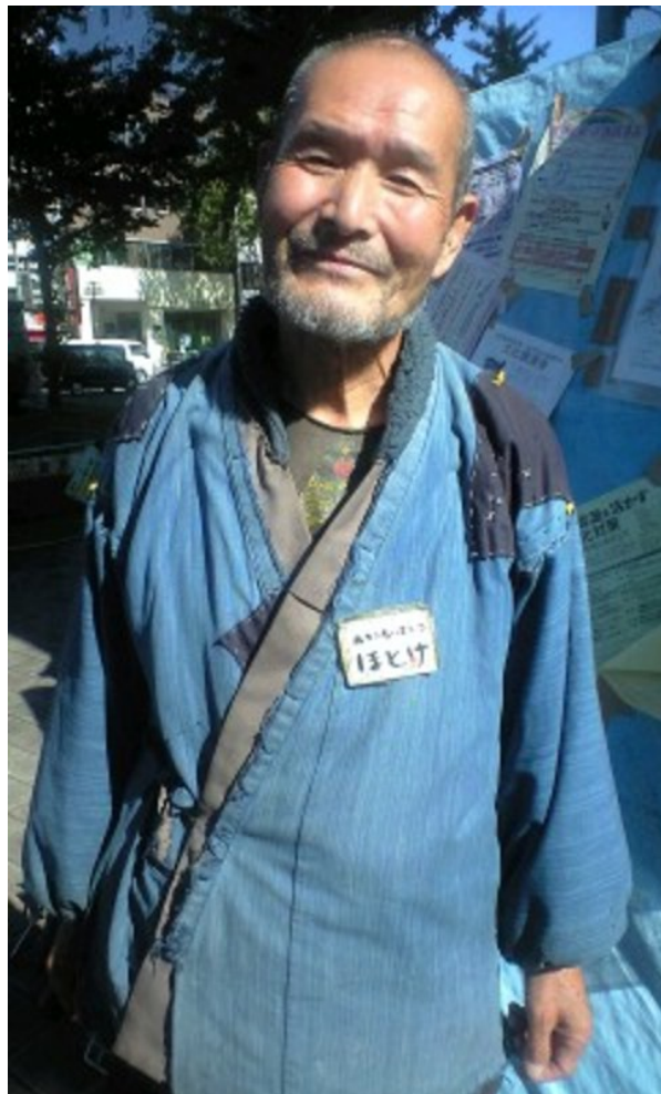
Hotoke in October 2011