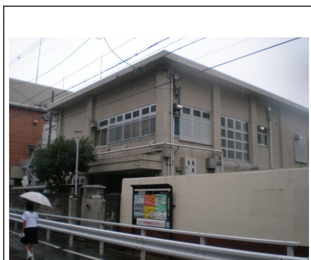
Nishinari Self-Reliance Support Center, Osaka

they are not to be spoiled by being given a whole pack of mainstream cigarettes such as people in regular employment smoke. The Nishinari Self-Reliance Support Center in Osaka gives its residents no cigarettes; instead the residents are made to work for 15 minutes every day, on cleaning and tidying the premises. Their wage for this labor is 300 yen – which they can feed into the cigarette vending machine in the lobby to buy a pack of twenty of their preferred brand. Here too, the importance of maintaining the men’s self-respect is emphasized, though this time the threat is seen as coming from getting something for nothing, rather than from having to search for dog-ends.