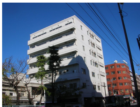
Hamakaze municipal homeless shelter, Kotobuki-chō, Yokohama

Here is a micro-level example of the regional variation in thinking on self-reliance. Tokyo's Ōta-ryō shelter gives each man a packet of twenty Mild Seven cigarettes a day. Staff explained to me that most of the men using the shelter were smokers, and if they were not given cigarettes, they would have to go around the streets looking for dog-ends, which would damage their self-respect. Mild Seven cost 300 yen a pack and are one of the principal mainstream brands smoked by salarymen. The Hamakaze shelter in Yokohama gives each man ten Wakaba cigarettes a day.