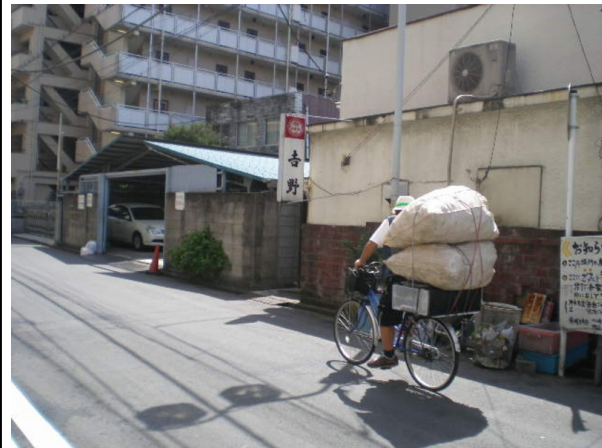
A good haul of cans

instance, or to muscle in on a garbage spot already being foraged by another man.