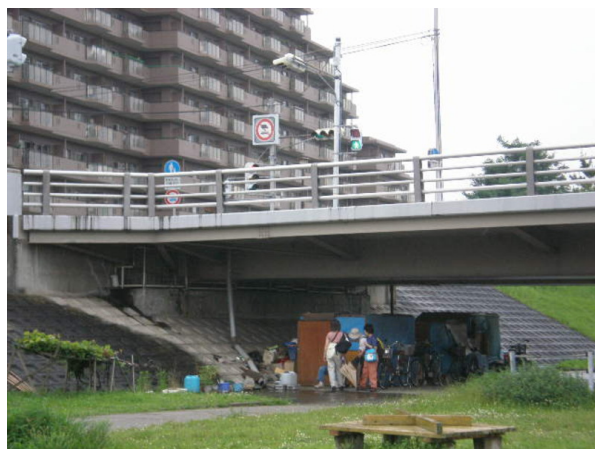
Homeless shacks on the Nishinomiya bank of the Muko River