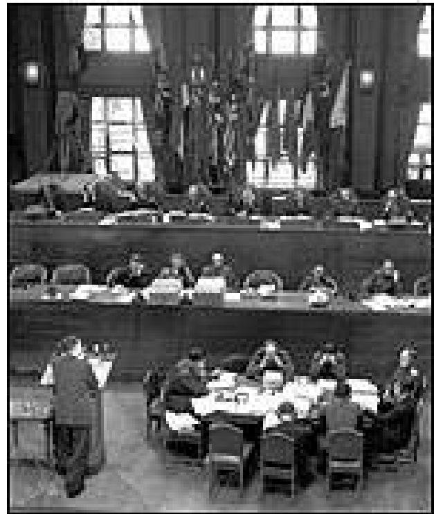
3. The Tokyo War Crimes Tribunal

The judges of the Tokyo War Crimes Tribunal were chosen from U.S. allies who fought in the Pacific War. The result is that the justices were from 11 nations, namely the U.S., the U.K., the Soviet Union, France, Australia, Canada, China, Holland, New Zealand, India and the Philippines. There were three Asian judges including one from China, which sustained by far the largest casualties of Japanese invasion (serious estimates range between ten and twenty million war-related deaths), as well as India and the Philippines. However, despite that fact that millions of Asian died in the war and it was Asia that bore the brunt both of Japanese colonialism and war deaths, no legal representative was drawn from Malaysia, Singapore, Indonesia, Burma, Indo-China, Korea or Taiwan, and the court was dominated by Western allies of the U.S. It should also be noted that the U.K., France and Holland as well as the United States were the colonial rulers of large areas of Asia, in which national independence movements were underway