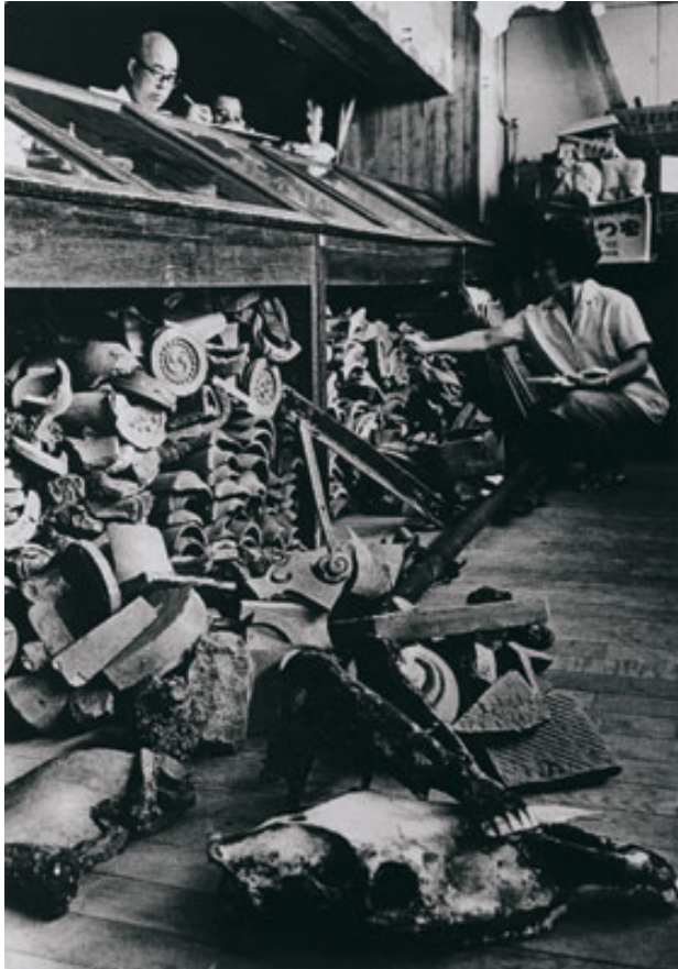
2. Collecting and classifying rubble that would eventually be exhibited at the Peace Memorial Museum.

Yet even this perception of “war victims” is rapidly fading, and younger generations no longer recognize their nation’s war responsibility or even the price that war exacted on their own society. Indeed, few have sufficient knowledge of Japan’s modern and contemporary history to hold opinions concerning Japan and war.