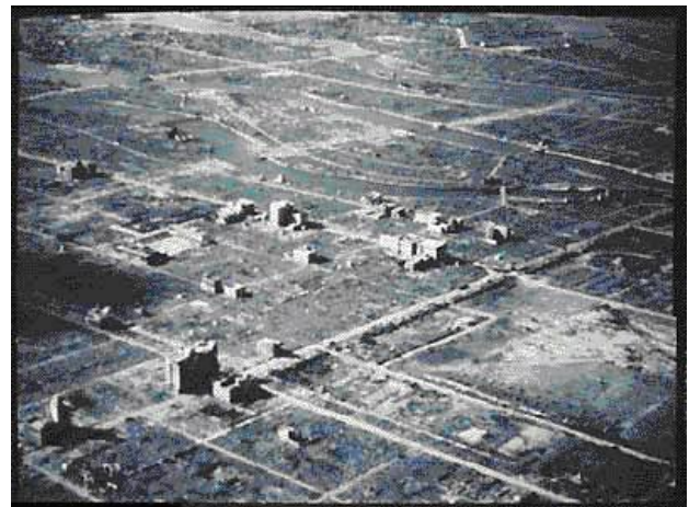
1. Hiroshima following the atomic bombing

'We hereby mourn those who perished in the atomic bombing. At the same time, we recall with great sorrow the many lives sacrificed to mistaken national policy.' (emphases added)