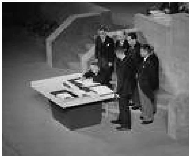
4. Prime Minister Yoshida Shigeru signing the San Francisco Peace Treaty

lashed Japan firmly within the arc of U.S. military power. With the refusal of the Soviet Union, Poland and Czechoslovakia to sign the treaty, and with neither the People's Republic of China (Beijing government) nor the Republic of China (Taiwan) invited to attend, despite the fact that China had suffered the heaviest casualties in the war against Japan, the treaty was clearly revealed as a Cold War instrument of the U.S. In addition neither North Korea, fighting the U.S. in the Korean War, nor South Korea were invited to attend, on the dubious ground that Korea was not a state at the time of Japan's surrender in 1945. India and Burma refused to participate in the conference, regarding it as a "rigged affair" so that only four Asian nations – the Philippines, Indonesia, Ceylon and Pakistan – attended the conference. Yet Indonesia never ratified the treaty, but signed a separate peace treaty with Japan in 1958. The Philippines only ratified the treaty after it came into effect. In this way, the "invisibility of Asia" was again conspicuous at the San Francisco Peace Treaty Conference.