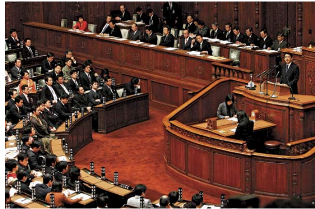
Prime Minister Abe opening the first Diet session of 2007

They now have a two-pronged strategy to meet American demands. In the short term, they hope to secure passage of a permanent law to authorize the overseas despatch of Japanese Self-Defence Forces for "international cooperation activities." That would obviate the current need for a "Special Measures Law" (with attendant Diet debate and inevitable restrictions and conditions) every time the SDF is to be sent on a mission. For the longer term, 239 present and former members of the national parliament joined on 1 May in a new organization, the Diet Members Alliance to Establish a New Constitution. Unlike its predecessors, this Association incorporates prominent members of the opposition Democratic Party of Japan. By thus incorporating the opposition, the revision requirement of a two-thirds parliamentary majority becomes feasible.