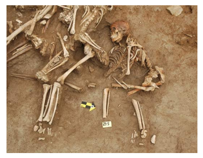
Photograph of remains of some of 110 victims executed by ROK forces at Cheongwon. Released by TRC in 2007

The TRC was established by the government of South Korea in 2005 and will issue its final report in 2010. It has received 10,907 petitions from individuals and organizations to investigate the history of the anti-Japanese movement during the colonial period and the Korean diaspora; the massacre of civilians after 1945; human rights abuses by the state; incidents of dubious conviction and suspicious death, including 1,200 incidents of mass civilian sacrifice committed by ROK forces and US forces (215 cases). In 2007 the TRC has excavated 4 among the 160 suspected mass graves. Then President Roo Moo-hyun has apologized to the citizens for the 870 victims confirmed at Ulsan. South Korea now has a new government and the TRC is currently fighting budget cuts and restrictions in order to complete its daunting and painful task.