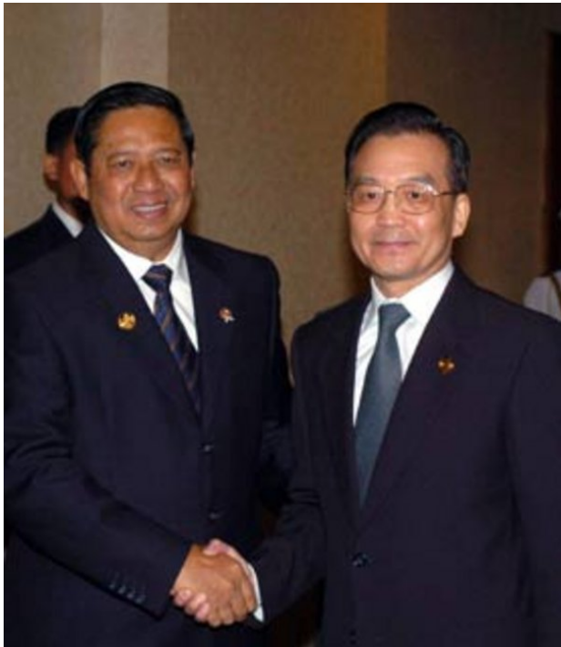
Indonesian President Yudhoyono welcomes Chinese Premier Wen Jiabao to Jakarta

addition to energy investment however, Jakarta is trying to encourage both countries to help overhaul Indonesia's physical infrastructure in order for the archipelago to be competitive in many different economic spheres rather than just commodities exports. Whilst Sino-Indonesian diplomatic relations are breaking new ground, it remains to be seen if the two sides' objectives and goals will be mutually compatible.