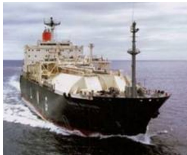
Japanese LNG tanker

For example, in March 2008 it was revealed that Japan has agreed to pay around U$16-18 per MBTU (million British thermal units) to renew the Bontang LNG contracts. [2] This figure, which surprised analysts, set a new record price for Asian LNG beating the previous high of US$11 per MBTU agreed between state-run Korea Gas and Qatar under a 20-year LNG deal signed in November 2006. Analysts have been concerned that such high prices might be unsustainable, in part due to a raft of new LNG schemes projected to come onstream around 2015. Alarmed by safety fears in its nuclear power network, Japan did not appear to have many viable alternatives and Indonesia was able to take advantage of such vulnerability to drive the price up.