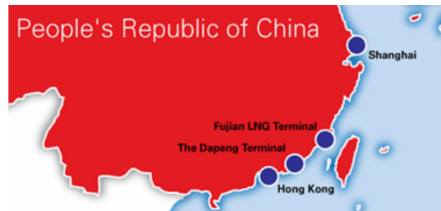
China's LNG receiving terminals

LNG on the international market was reflecting a supply glut, and Purnomo claims Indonesia had also recently lost tenders in Taiwan and South Korea. Having difficulty wooing buyers in Japan too, the original Tangguh pricing formula reeked of desperation. For different reasons, this formula is now causing consternation among both Chinese and Japanese buyers, and in hindsight seems to have been handled poorly by the Indonesian government.