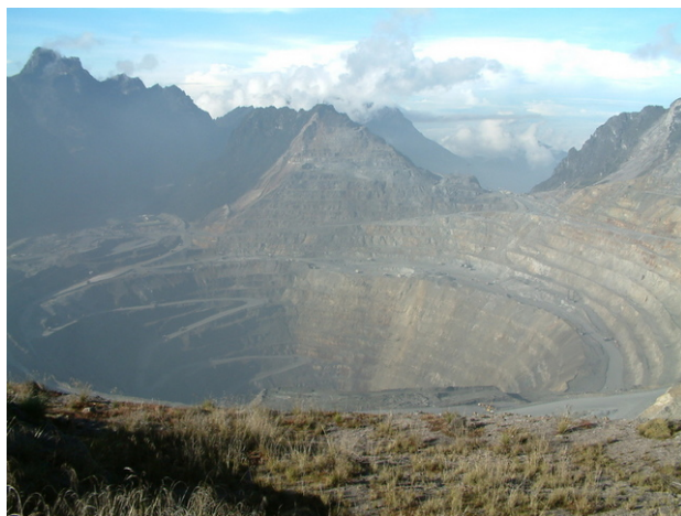
The Grasberg mine

increase the archipelago's economic prosperity. Attracting foreign capital to spur fresh mineral exploration has become a priority in the face of declining output from the archipelago's existing oil and gas fields. This decline has forced Indonesia to become a net oil importer and to scale back LNG exports from existing plants. Nevertheless, the country remains a major repository of resources and home to significant reserves of oil, coal, and natural gas, as well as being the world's second largest producer of copper and tin and the fourth largest of nickel. The Grasberg mine in Papua remains the world's largest gold mine, and Indonesia is also a major exporter of palm oil, cocoa, and coffee. Until the recent global recession, strong demand from China and India was driving prices for many of these commodities up to record levels. With China becoming one of the biggest investors in them, Trade Minister Mari Pangestu wants to position Indonesia to ride the bandwagon of China and India's economic growth.