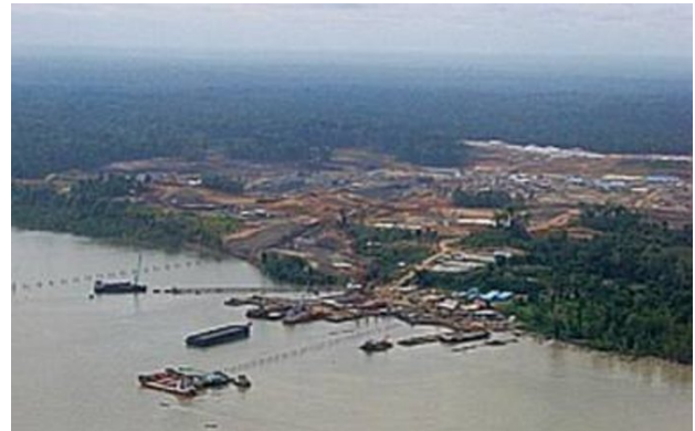
Tangguh LNG facility under construction

become politicised. Whilst the PDI-P has stressed that both President Yudhoyono (SBY) and Kalla were also serving in the Megawati government at that time, the Tangguh issue could easily end up as ammunition for SBY and Kalla to attack Megawati during the presidential race of 2009. Such a scenario could complicate relations with China.