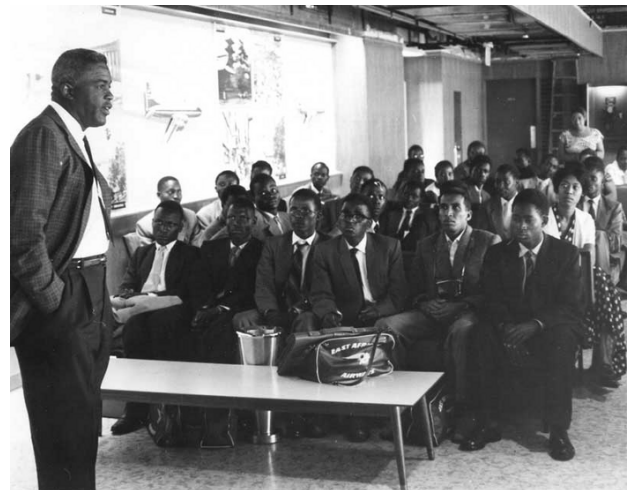
Baseball legend Jackie Robinson, who backed efforts to bring African students to the United States, greets the first "African Airlift" arrivals in New York in September 1959.

good fortune of a competitive U. S. presidential race: he first approached Richard Nixon, whose overtures to the State Department were rebuffed, then John F. Kennedy, who possessed both private wealth and an eagerness to demonstrate support for African independence, in part as a way to send positive messages to African-Americans that did not involve binding civil rights commitments. The resulting “Kennedy airlift” was produced by a unique confluence of events, but suggested the broader ways that, at particular junctures of global and domestic U. S. politics, student migration could emerge as at least a symbolic priority. It did not, however, not solve the problems of the Kenyans who, like many foreign students, faced poverty in the United States. 76