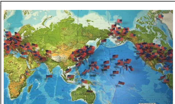
The empire of bases. A graphic from Living Along the Fenceline.

Two recent documentaries make excellent viewing for anyone interested in the history of American military bases overseas - and their ongoing ramifications. With an estimated 1,000 US military bases outside of the 50 states, the United States currently has the largest number of overseas military bases of any country in history. Why does the US need military bases in over 130 countries? Why do countries like Germany, Italy, Japan and South Korea still host hundreds of American military bases and thousands or tens of thousands of US soldiers, more than six decades after World War II? Why is the US still aggressively expanding into many new countries? Standing Army (72 min., 2010) is a far-reaching exploration of the ideological and geo-political answers to these questions. Living Along the Fenceline (67 min., 2011), though also international in scope, is a more narrowly focused film, answering a critical question: How do these bases affect local populations? Offering both global and personal perspectives, these two films are complementary and would work well together as tools to initiate dialogue and discussion on base issues and the role of American global military power.