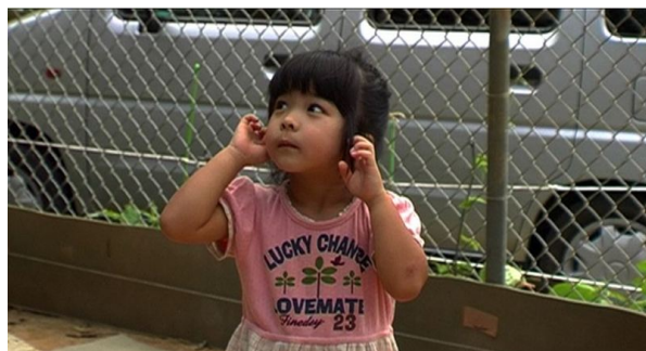
A girl covers her ears from the noise at a preschool near Marine Corps Air Station Futenma in Okinawa, in a scene from Standing Army (courtesy of the