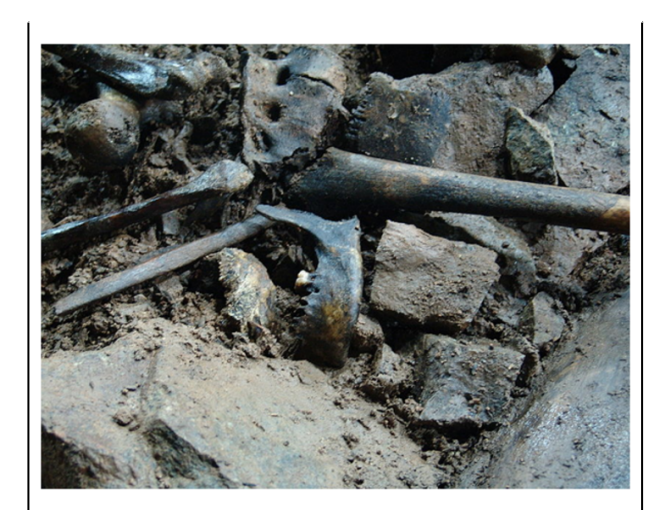
Exhumation site at Kyŏngbuk Cobalt Mine