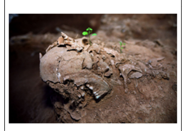
Remains unearthed at Kyŏngbuk Cobalt Mine

truck arrived. If a person did not die by bullet, he or she was clubbed or stabbed. The bodies were thrown into the mine. Some of the bodies were doused in oil and burned. The shaft is about 70 to 80 meters deep. It is said some that 2,300 people were thrown down at the spot I was standing. When I stood where they were shot, I felt the fear and hopeless the victims must have experienced just before they died.