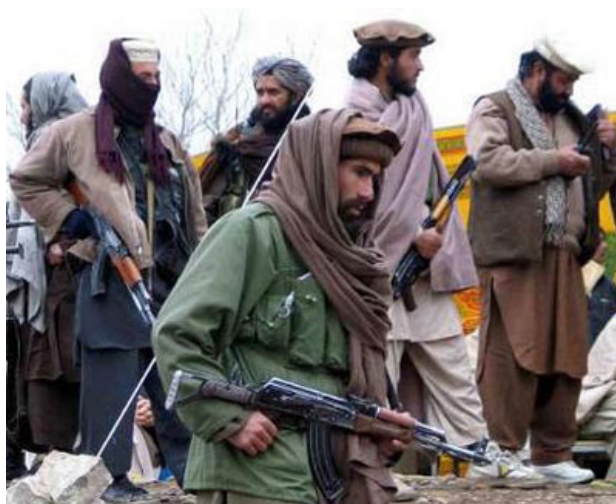
Taliban fighters in South Waziristan, their stronghold in Pakistan

Despite brave chest-beating in the national press about the need to make the war on terror Pakistan's war, it appears that the Taliban has done a very good job of convincing Pakistani opinion that peace in the heartland and accommodation on the borderlands is preferable to a titanic struggle against intermeshed Pashtun and Islamic conservative interests.