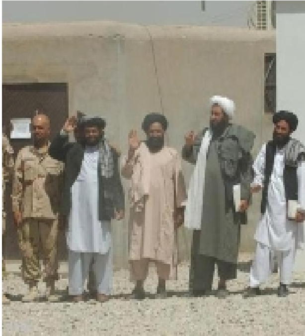
Karzai administration officials and Taliban rebels negotiate

Karzai also invited Mullah Omar to join him in the political process of Afghanistan by being hopeful for the next presidential election as Karzai reckoned Omar's return in the best interest of the prosperity and safety of the country. [emph. added]