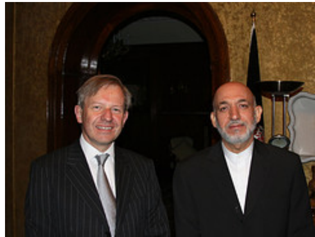
Cowper-Coles and Karzai

our public opinion" for such an outcome.