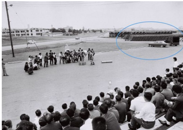
US military PR exercise for Operation Red Hat

These accounts have caused alarm on Okinawa where local residents have, for the past 12 months, been urging the authorities to conduct environmental tests within the bases where U.S. veterans allege Agent Orange had been stored. However, both Tokyo and Washington have refused these requests. 6