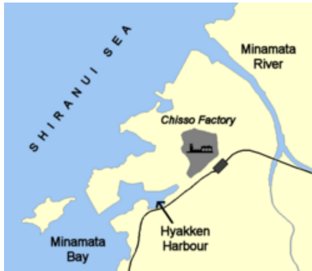
Chisso plant, the Shiranui Sea, and the plant runoff

I often used to go together with my blind, half-mad grandmother to visit this Umawari no Tomo, which in later years would take on such profound significance. There were also times that I went by myself. It was at the beginning of the Shōwa era, before I began primary school. No one lived on the embankment, and when adults gathered to drink they spoke about Umawari no Tomo as “the place where they come out to play”—they meaning various divine beings, foxes and kappa , “Motan no Moze” or “Tabira no Taze” or “Gane no Aragami-sama,” among other invisible deities. When night fell, from Nagasaki and Shimabara, from the Satsuma islands, they would come over, one after another, crossing the Shiranui Sea.