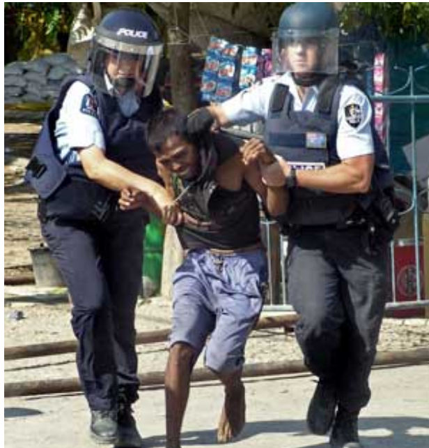
A youth is detained by Australian police in East Timor, 2006.

This officer says the gang violence has reached a new stage that it shows signs of coordination. Whereas previously gang attacks seemed random, they are now being choreographed. He noted an evening when three melees broke out simultaneously in different areas in Dili in a move that seemed designed to test the responses and capabilities of the over-stretched security forces.