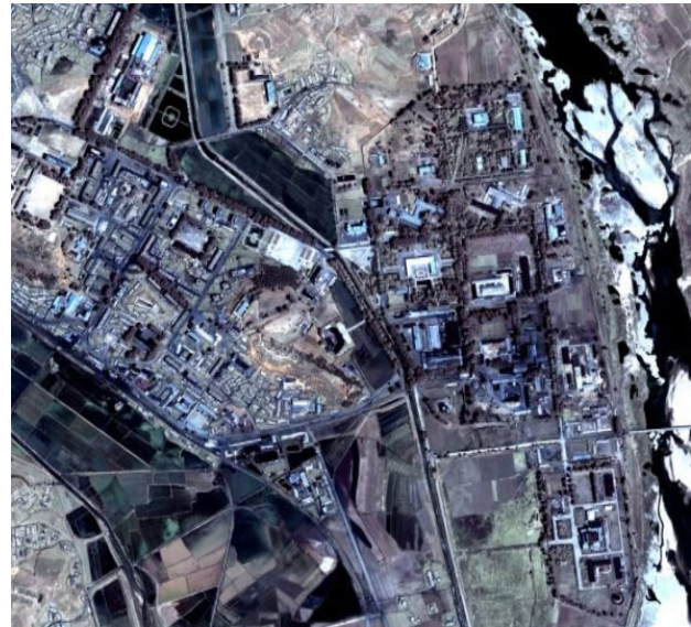
Yongbyon Nuclear Facility

Bolton slips in a sly suggestion that North Korea is cloning Yongbyon elsewhere. In briefings with its Asian allies in early 2005, the United States similarly accused North Korea of providing Libya with uranium hexafluoride. It turned out that the U.S. government had misled its allies, however. North Korea had provided the material to Pakistan, which already has a nuclear program, a business transaction that the United States had known about for years.