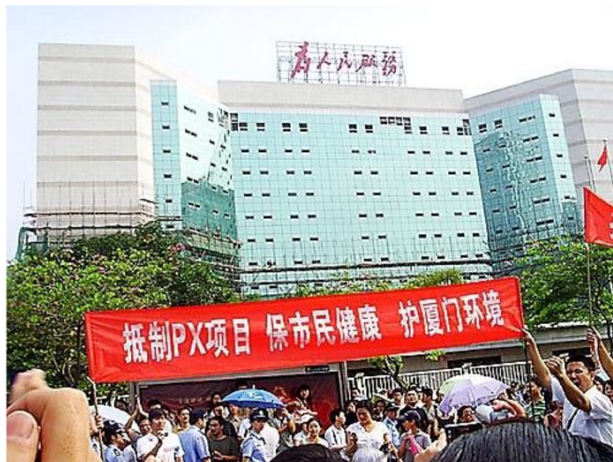
Protest of Xiamen residents against the Xiamen PX (Paracylene) Project, June 2007.