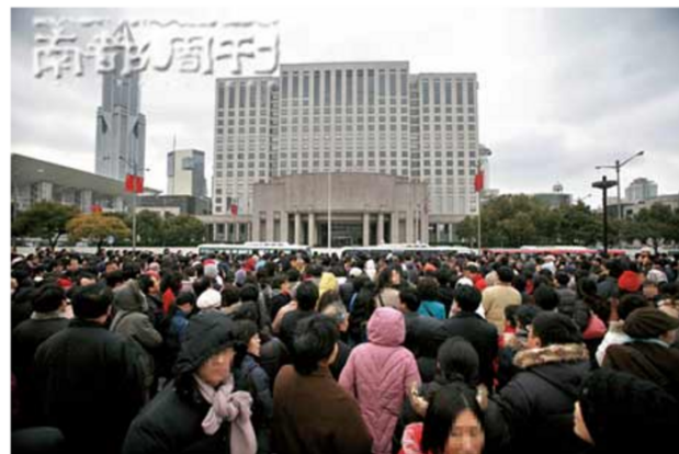
Shanghai residents' "collective walk" at People's Square in protest against the Maglev Train project, January 2008.