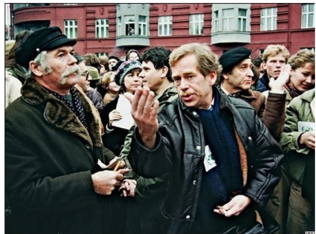
Vaclav Havel (right) and other Charter 77 signatories address demonstrators in Prague on December 10, 1988, to celebrate the 40th anniversary of the Universal Declarations of the Human Rights.

Constitution of the United States, the French Declaration of the Rights of Man and Citizen, the Universal Declaration Human Rights of the United Nations, and the reconciliatory approach of South Africa's Truth and Reconciliation Commission, as well as relevant Chinese documents throughout the modern era, including the Constitution of the People's Republic of China.