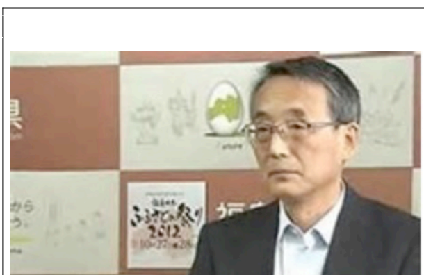
Tanaka Shun'ichi is Chair of the Nuclear Regulation Authority

new safety standards draft was greeted by significant protest from the utilities, which fear that total costs of implementing these standards may amount to as much as 1 trillion Yen. 187 These protests seem to be a good initial sign of stricter administrative oversight. The NRA is also re-examining safety assessments on fault lines below existing nuclear plants and has concluded that some reactors are sited on active faults. Nevertheless, one of the greatest challenges for the NRA will be to foster employees with specialized knowledge and expertise who do not have close ties to the nuclear village and will thus ensure institutional independence. Most of the current NRA employees were simply transferred from the previous regulators, NISA and NSC, and many lacked sufficient expertise. 188 Moreover, the five commission members of the NRA have been criticized for their close relations to the nuclear village. 189 In line with the Diet-led commission's suggestion, the Lower House set up a panel in April 2013 to monitor nuclear power administration. However, this panel has been criticized for its pro-nuclear makeup. A former member of the Diet-led commission suspected the LDP might use it to apply pressure on the NRA to loosen regulations, rather than ensuring strict oversight. 190