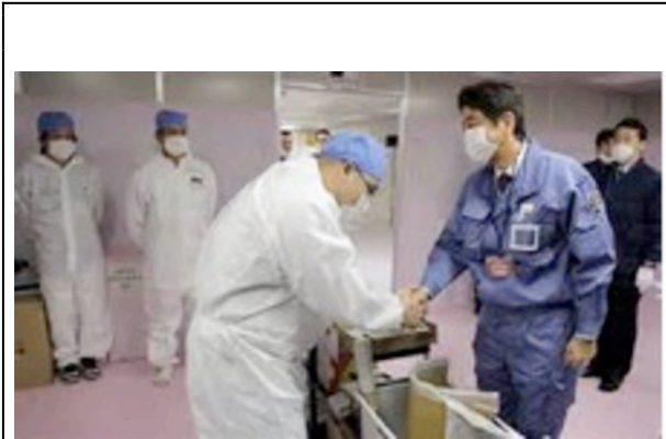
Prime Minister Abe Shinzō Inspects Stricken Fukushima Plant

regulatory oversight and crisis management. While on the surface these reforms follow key suggestions made by the four investigations, it is uncertain whether the mindset of those responsible for ensuring safety has fundamentally changed.