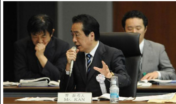
Prime Minister Kan Naoto Testifies to Diet Commission

independently from the government. Seeking to bolster the commission's credibility, Kan outlined three principles as the basis of the inquiry: independence from the existing nuclear energy administration, openness in disclosing findings domestically and abroad, and comprehensiveness in covering both technical and administrative questions related to the accident. 9