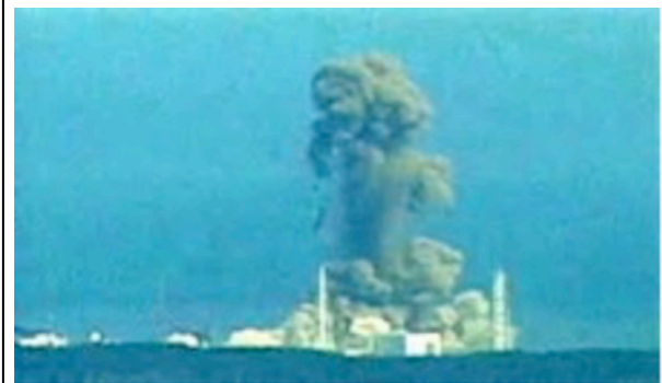
Explosion at Fukushima Daiichi Nuclear Power Plant March 2011

Despite the severe consequences from the Fukushima nuclear disaster, Japan's current government appears determined to return to the pre-disaster policy of promoting nuclear power as a key source of energy, promising improvements in safety standards. 2 The governing Liberal Democratic Party (LDP) will likely take controversial decisions on reactor restarts following the July 2013 Upper House election. Given this outlook, it seems crucial for Japan and others to reflect on and incorporate the lessons that can be drawn from the Fukushima disaster, so as to prevent or better contain possible future crises.