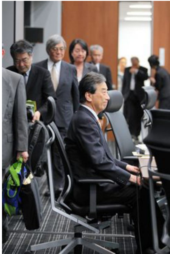
Kurokawa Kiyoshi Chaired Diet Inquiry

Overall, the team conducted interviews and hearings with almost 1,200 people, including witnesses who held key positions at the time of the accident within the government, at TEPCO or at nuclear regulatory agencies. The commission also conducted a survey of more than 10,000 residents of the affected areas and workers at the plant. 23 Initially, the LDP-led opposition and the DPJ disagreed on whether to make hearings open to the public. In the end, they agreed to state in vague terms that hearings should be ‘basically open’ ( kōkai ga kihon ), leaving the commission with significant leeway on how to proceed. 24 While most hearings were open to the public, exceptions were made for some key witnesses. The Diet’s investigation committee published its final report of about 640 pages in July 2012. In its