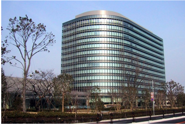
Toyota Corporate Headquarters, Toyota City

But it is no longer the case. No matter how poor the domestic market gets, these companies continue to rake in money. Such a situation might be remedied if these companies were paying corporate taxes on their profits but this is not the case. Normally companies pay corporate taxes of about 5 percent, but these top companies dedicated to exports only pay about 1 percent. There is a debate about whether corporate taxes of 4 percent are too high or low, but in fact these companies benefit from special privileges that allow them to avoid paying anything close to that. The late Socialist politician, Kubo Wataru, who later served as Minister of Finance during the LDP-Socialist-Sakigake coalition government, asked during a Diet session how much Toyota Motor Company actually pays in taxes. The minister at the time said that the information was a corporate secret so he could not disclose it. Many companies like Toyota that focus on exporting their products benefit from a wide variety of special tax exemptions and other deductions, whose total extent is unclear. If someone were to repeat this question in the Diet now, probably no one could come up with a reliable answer. Indeed, Japan may have the lowest effective tax rate in the world.