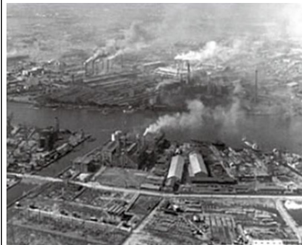
Industrial Osaka, 1955

Beginning in the 1950s and lasting well into the 1970s, Osaka suffered from severe environmental problems.