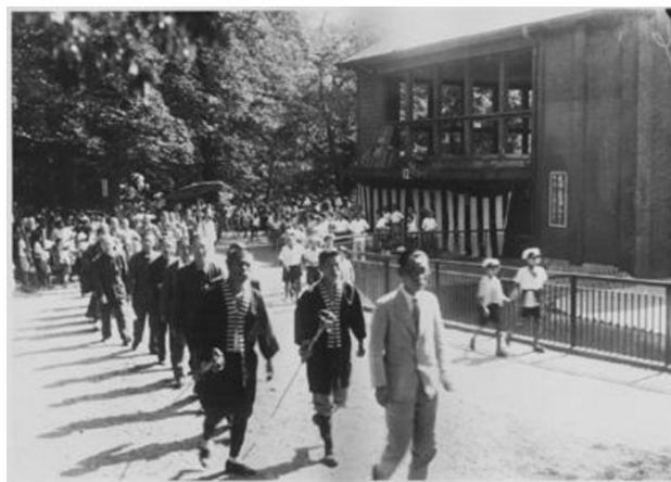
The memorial service on September 4, 1943; notice the striped bunting

were still starving—literally a stone's throw away. The elephant house had been covered at that time with a striped bunting (Ueno, 1982a, 177).