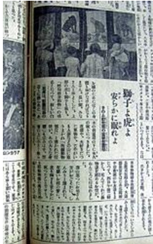
A newspaper for children, the “Shōkokumin shinbun”, reports on the memorial service

On September 2, the metropolitan government officials sent a notice to newspapers about the “disposal” of the wild beasts at Ueno Zoo and the intention to hold a memorial service ( ireisai ) for them on September 4 (Ueno, 1982a, 177). This event was not only attended by several high-ranking Tokyo officials, among them the governor himself, but also by hundreds of school children, who had been specifically targeted as an audience (Hasegawa, 2000, 23).