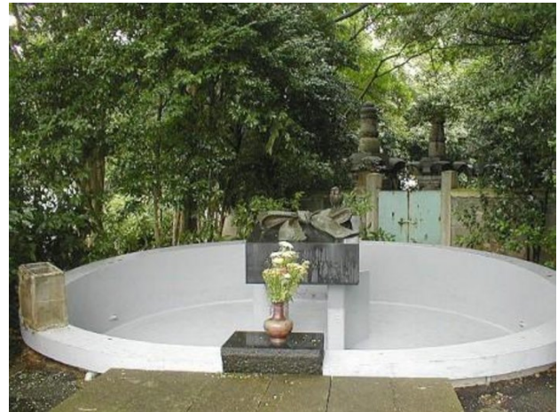
The new memorial (erected in 1975) for animals that died in Ueno Zoo

aimed at children, this time for “peace”. Often depicted in harrowing detail, yet deeply sentimentalized, their story is meant to show how horrible war can be (e.g., Tsuchiya & Takebe, 2009).