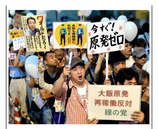
Anti-nuclear power activists in the weekly demonstration at the prime minister's office Sept. 14, calling for the abolition of nuclear power. "Nuclear Zero Right Now."

Observers see the policy as a product of compromise, and something which Prime Minister Noda hopes will both get him reelected in a party leadership race this month and win support from ordinary voters in the upcoming Lower House election. Noda himself is unwilling to dump nuclear power. It is instead what the public and many in his Democratic Party of Japan have increasingly been demanding.