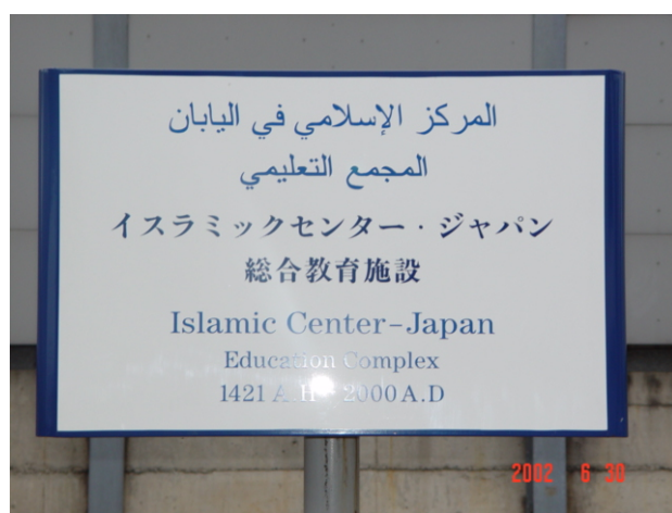
Islamic Center of Japan