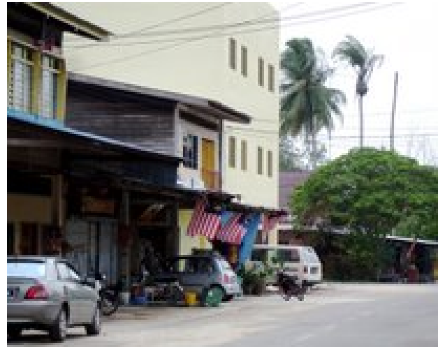
Kampong Hubong was once New Syonan

These days Kampong Hubong is a cul-de-sac on the map of Malaysian modernization. But once, for just two short years between 1943 and 1945, Kampong Hubong was closer to the core of things: a new community called New Syonan that emerged from the conditions of Japan's occupation of Singapore, and acted as a highway for the delivery of imperial Japanese ideology about Asian unity and cooperation.