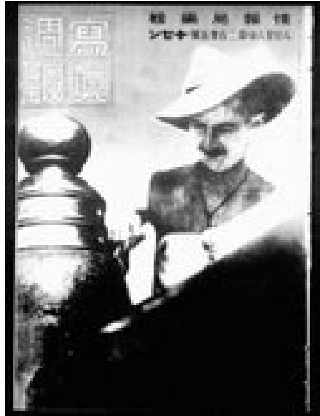
A POW builds Syonan Jinja

Shuho, sold at most Japanese news outlets and bookstores, has a cover photograph of a bare-chested POW wearing a "digger" hat, burnishing the brass fittings on a post of the Japanese-style arched bridge leading to the shrine grounds, and an inside photo spread of POWs toting construction materials and winching a torii gate into position, all accompanied by a brief but swaggeringly victorious text.