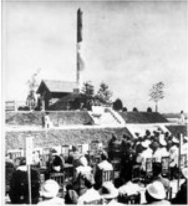
Opening ceremony at Syonan Chuureitou

Source: Shashin Shuuhou, Number 242 , October 14, 1942. Japan Center for Asian Historical Records. Accessed 14/11/2007