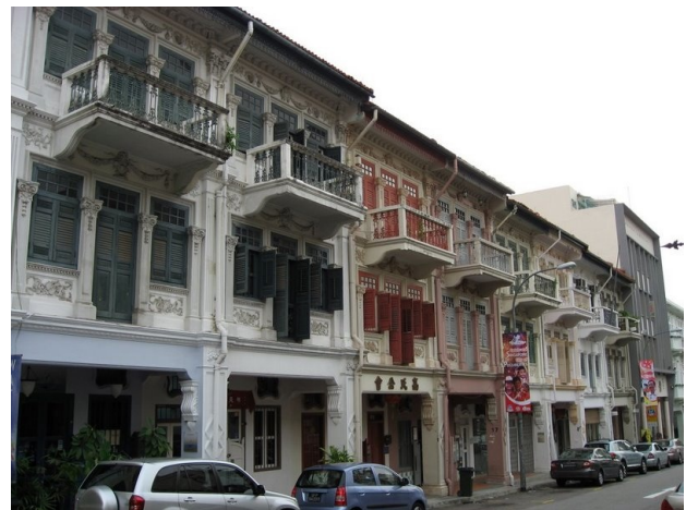
Shophouses on Bukit Pasoh Road where comfort women once worked

British Singapore had been infamous for its sex trade; Japanese rule introduced new elements to the city’s existing business of servicing men’s sexual desire. The military authorities installed “comfort women” in requisitioned properties and turned them into “comfort stations” at Tanjong Katong Road, Wareham Road, Branksome Road, in the York Hotel, in the Anglo-Chinese School at Cairnhill Road, and in houses at Bukit Pasoh Road. Local Chinese women were the military’s first choice and comprised the majority of women forced into sexual servitude, but “comfort stations” in Singapore also included Korean and Indonesian women, as well as some Japanese women reserved for the officers. [2] Lines of Japanese soldiers waiting stolidly for their turn on the bodies of “comfort women” became a common sight. Enterprising local boys gathered up used condoms outside the comfort stations, washed them, put them in bamboo tubes, powdered them, rolled them up and resold them to Japanese soldiers.[3]