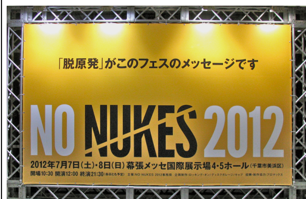
The Entrance to the Concert

On July 7–8, 2012, a two-day mass rock concert called No Nukes 2012 was held in the Makuhari Messe Convention Center in Chiba, near Tokyo. The organizer was Sakamoto Ryuichi , member of the groundbreaking Japanese technopop group Yellow Magic Orchestra (YMO) and Academy Award-winning composer. Profits from the concert were donated to Sayonara Genpatsu 1000 Man Nin Akushon (Citizens' Committee for the 10 Million People's Petition to say Goodbye to Nuclear Power Plants), an antinuclear group which Sakamoto has been backing, along with Nobel Prize-winning author Oe Kenzaburo and others. The concert featured performances by 18 groups, including pioneering electronic groups Kraftwerk and YMO as well as rock bands Asian Kung-Fu Generation, Acidman, and others.