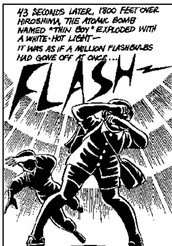
The atomic bomb explodes

grader. Back then, school evacuations began with third grade. I envied him, thinking that if you went to the countryside, you'd probably be able to eat your fill. But a letter came, and in it he moaned that he was getting thinner and thinner and please send soybeans. So I heard Dad say more than once, "I wonder if we should bring him back." It was just before the atomic bomb. Had Dad brought him back, they'd have died together in the atomic bombing. Even if you went to the countryside, you couldn't eat your fill: I realized that keenly.