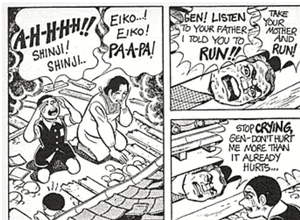
Gen's father's death

What differs about the death of my father from Barefoot Gen is that I myself wasn't at the scene. Mom told me about it, in gruesome detail. It was in my head, so in the manga I decided to have Gen be there and try to save his father.