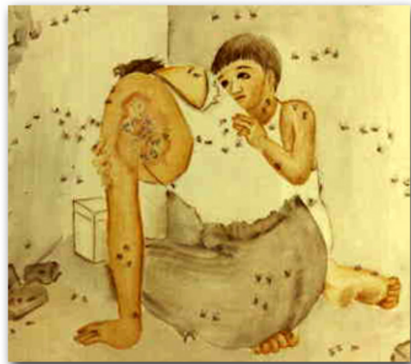
A child clings to mother whose wounds bred maggots 11 days after the bomb. Drawing by Ichida Yuji.

couldn't open your eyes. And they attacked you! Despite the atomic bomb, flies bred. It's strange, but maggots are really quick. In no time at all they were everywhere. Horrible, really. And that maggots should breed like that in human bodies! If you wondered what that was moving in the sky, it was a swarm of flies. The only things moving in Hiroshima were flames as corpses burned, and flies as they swarmed.