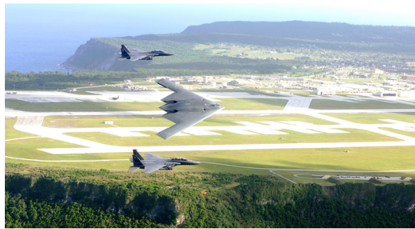
B-2s and F-15 fly over Andersen Air Force Base

Even if he is right, however, and the Pentagon has indeed decided to convert Guam into the core military fortress for the region, that is not to say that the US would be likely to let Japan off its promise to build, refurbish and pay for an additional base for them, particularly a multi-service base with deep-sea port and expanded and upgrade air force facilities such as attached to the Oura Bay design at Henoko.