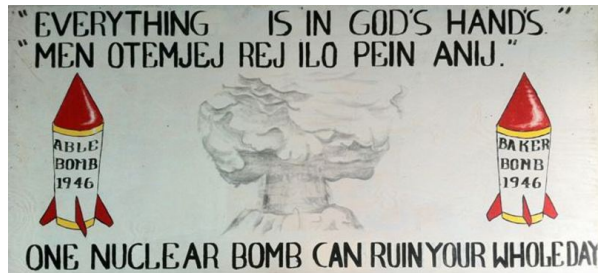
Artwork hanging in Bikini City Hall on Majuro Atoll

Finally, and surprisingly, the report barely mentions the American strategic military base that dominates the atoll of Kwajalein (the Ronald Reagan Ballistic Missile Defense Test Site). By ignoring this facility, the report leaves open the strategic and environmental impact of the operation of this military base on the Marshallese. 3 The psychological impact of an ongoing missile test site in a nation still traumatized by decades of contamination, secrecy, exclusion and neglect by nuclear weapons testing must not be ignored. A further implication not considered by the report is the Republic of the Marshall Islands joining with other regional nations in signing the Treaty of Rarotonga that formalizes a nuclear weapon free zone in the Pacific. 4