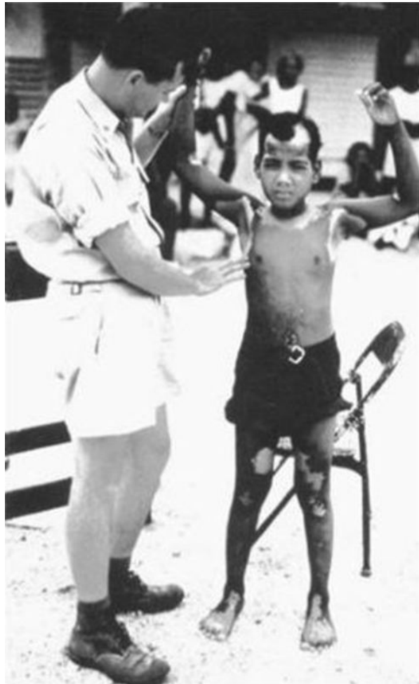
A Rongelapese child being examined by an AEC doctor after his exposure to radioactive fallout from the Bravo test (1954)

What is required is a truly independent radiological survey conducted by competent and independent authorities not unduly influenced by the historical perpetrators of the activities they are investigating.