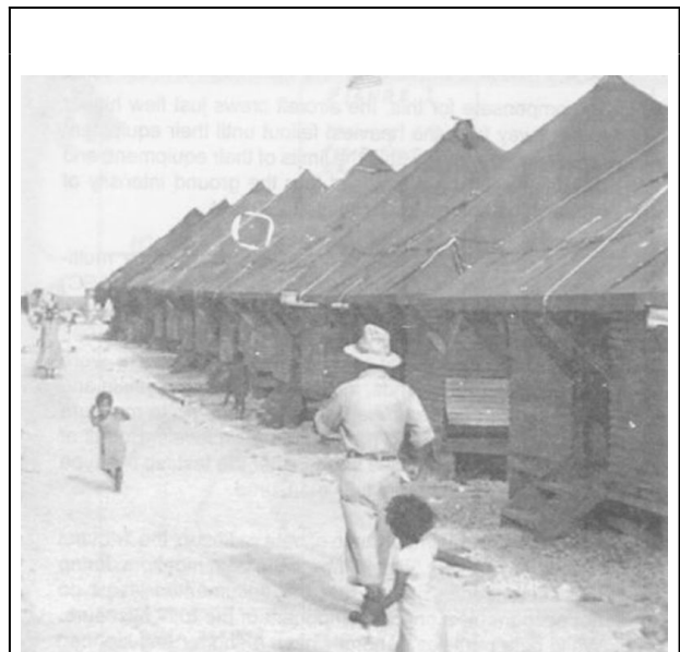
Bikinians in the housing provided for them as refugees (1948)

This report offers an important step forward in addressing the devastation to both community