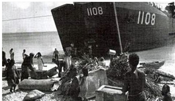
Residents of Bikini Atoll being forcefully evacuated so that it can be used for nuclear weapon testing (1946)

Finally, and surprisingly, the report barely mentions the American strategic military base that dominates the atoll of Kwajalein (the Ronald Reagan Ballistic Missile Defense Test Site). By ignoring this facility, the report leaves open the strategic and environmental impact of the operation of this military base on the Marshallese. 3 The psychological impact of an ongoing missile test site in a nation still traumatized by decades of contamination, secrecy, exclusion and neglect by nuclear weapons testing must not be ignored. A further implication not considered by the report is the Republic of the Marshall Islands joining with other regional nations in signing the Treaty of Rarotonga that formalizes a nuclear weapon free zone in the Pacific. 4