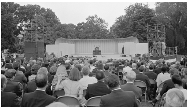
The Stage Where President Johnson Spoke at the White House Festival of the Arts.

George Kennan's speech, delivered during a luncheon for attendees at the National Gallery of Art under the title "The Arts and American Society," also revolved around the meaning of cultural freedom for artists and intellectuals in America. Kennan was an expert on international relations and the Soviet Union who is remembered for responding to the spread of Cold War communism by advocating for a policy of containment. He had little relationship to Johnson himself. In fact, Kennan once wrote that Johnson represented an "oily, folksy, tricky political play-acting" that combined a "self-congratulatory jingoism" with the "whiney, plaintive, provincial drawl and the childish antics of the grown male in modern Texas—this may be the America of the majority of the American people but it's not my America" (Quoted in Gaddis 2011, 590). Although Kennan is rarely associated with the art world, he