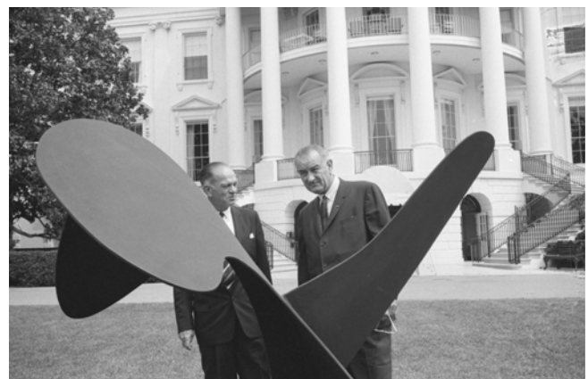
Photos above: President Lyndon Baines Johnson (on right in both photos) with Senator William Fulbright at the White House Festival of the Arts.