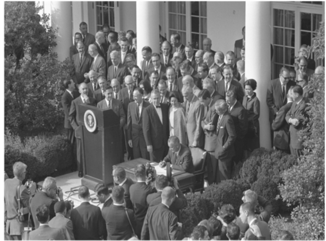
President Johnson signs the National Foundation on the Arts and Humanities Act, September 29, 1965.

President Johnson signs the National Foundation on the Arts and Humanities Act, September 29, 1965